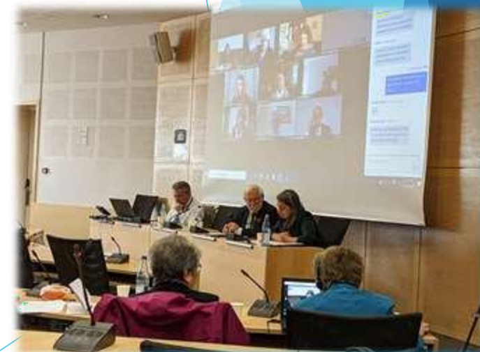
Webinar "Human trafficking on the flight from conflict" - 18.10.2022