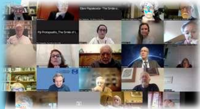
Migration and Health Webinar. - 13.02.2024