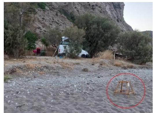
Photos 8a, 8b, 8c: Human presence during nighttime on nesting beaches. 8a, left: Tent on Daphni beach (August 2022). 8b middle: Tent and canoe on Sekania beach (June 2022). 8c right: Caravan on Daphni beach (July 2022).