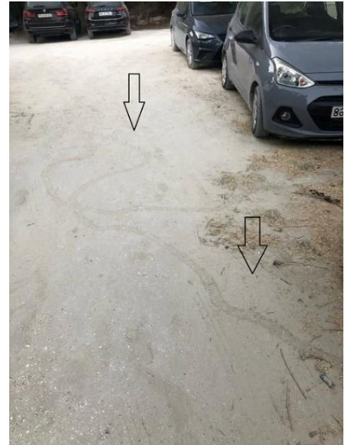
Photo 1b: Disorientated hatchling tracks at a parking lot behind Daphni beach (September 2022).