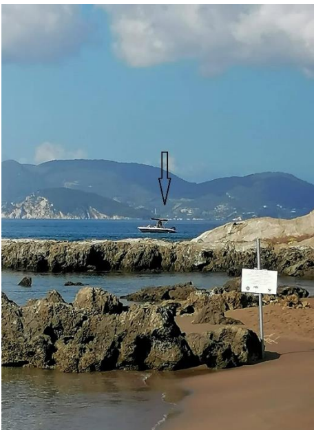
Photo 4: Boat (arrow) entered and remained in zone A near Sekania beach (August 2022).