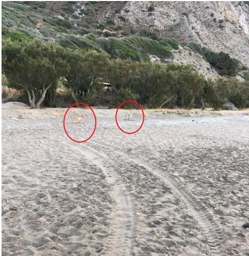
Photo 9a: Quad tire tracks near caged nests (circles) on Daphni beach (August 2022).