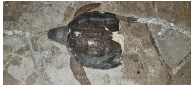
Photo 3b (top): Injured sea turtle from boat collision within the marine protected area (July 2022). The turtle died shortly after. Photo 3c (bottom): Dead sea turtle from boat collision found in Zakynthos port (September 2022).