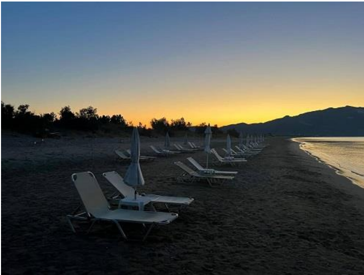
Photo 6a: Unstacked sunbeds during nighttime on East Laganas nesting beach (July 2022).