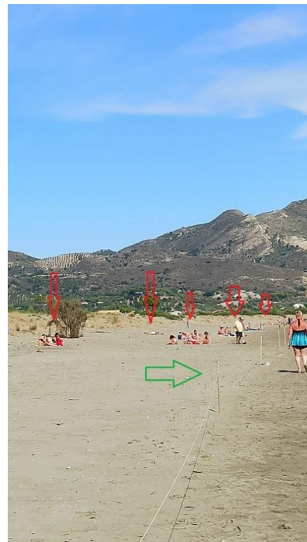
Photo 10: Although the beach use during the incubation period should be restricted within the front 5m from the shore, and although ropes have been placed by MU of NMPZ (green arrow), beach users kept violating that restriction (red arrows) on East Laganas beach (August 2022).