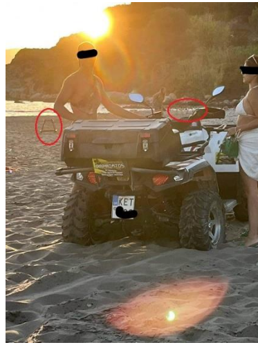
Photo 9b: Visitors entered the nesting beach and drove next to protected nests (circles) (Daphni beach, September 2022).