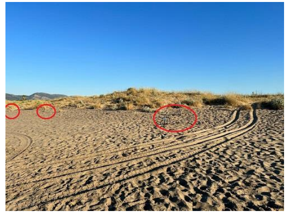
Photo 9c: Tire tracks on East Laganas beach next to nests (circles) (June 2022).