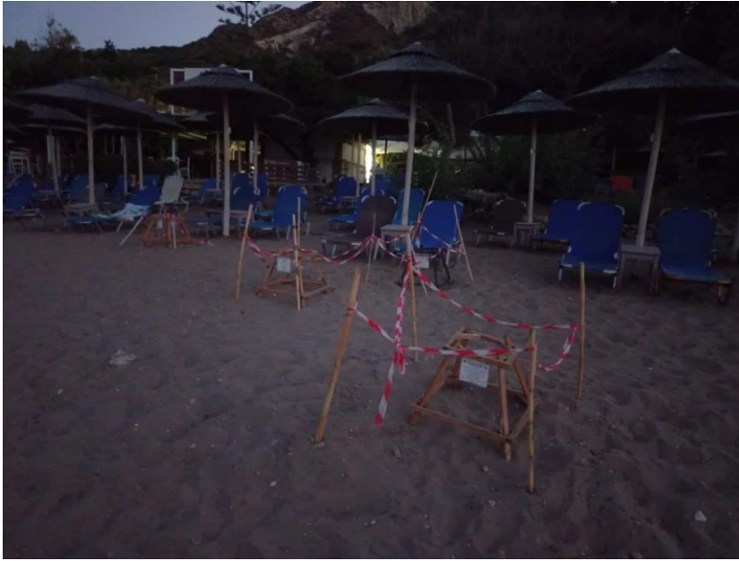
Photo 1a: Light pollution on Daphni beach in great proximity to incubating sea turtle nests (September 2022).