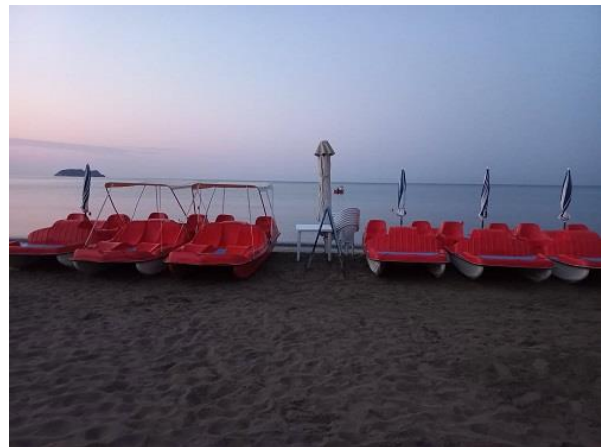
Photos 7a, 7b: Water sport equipment is always left on the protected nesting beach (East Laganas beach) deterring nesting females to emerge on the beach to nest (photo 7a was taken in June & photo 7b was taken in September 2022).