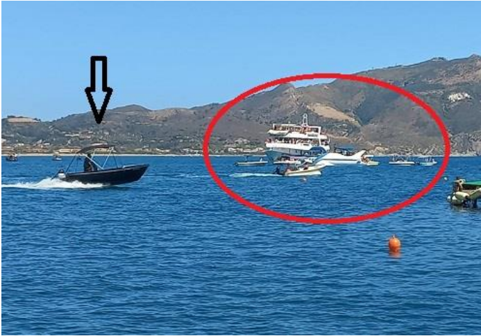
Photo 3a: Boat speeding (arrow) and numerous turtle spotting boats (circle) crowded to watch the same turtle. Marine protected area of Laganas Bay (September 2022).