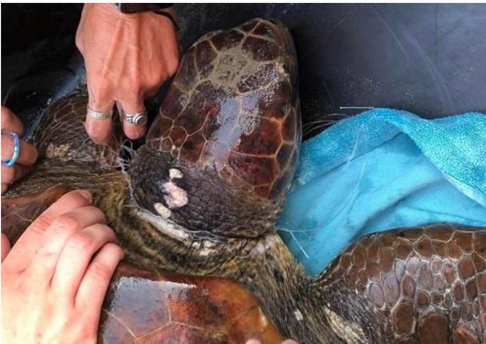
Photo 2: Injured sea turtle entangled in fishing line found in the marine protected area of Laganas Bay (July 2022).