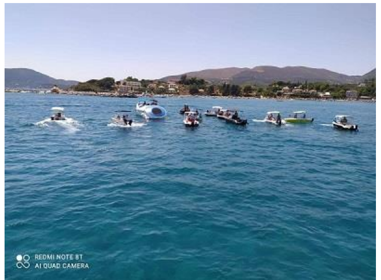
Photo 5: Turtle spotting in the marine protected area of Laganas Bay. The number of boats exceeds the permitted number of two boats watching a sea turtle at the same time (August 2022).