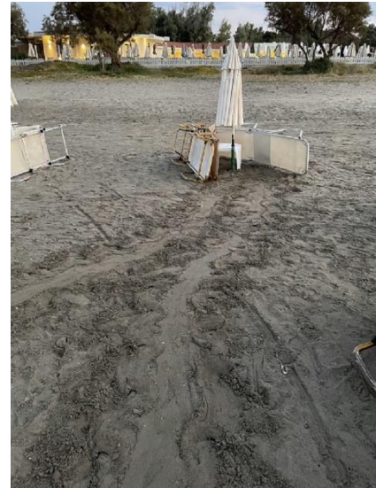
Photo 6b: Unsuccessful nesting attempt. Female turtle abandoned the attempt after she got disturbed by the sunbeds on Laganas Bay (June 2022).