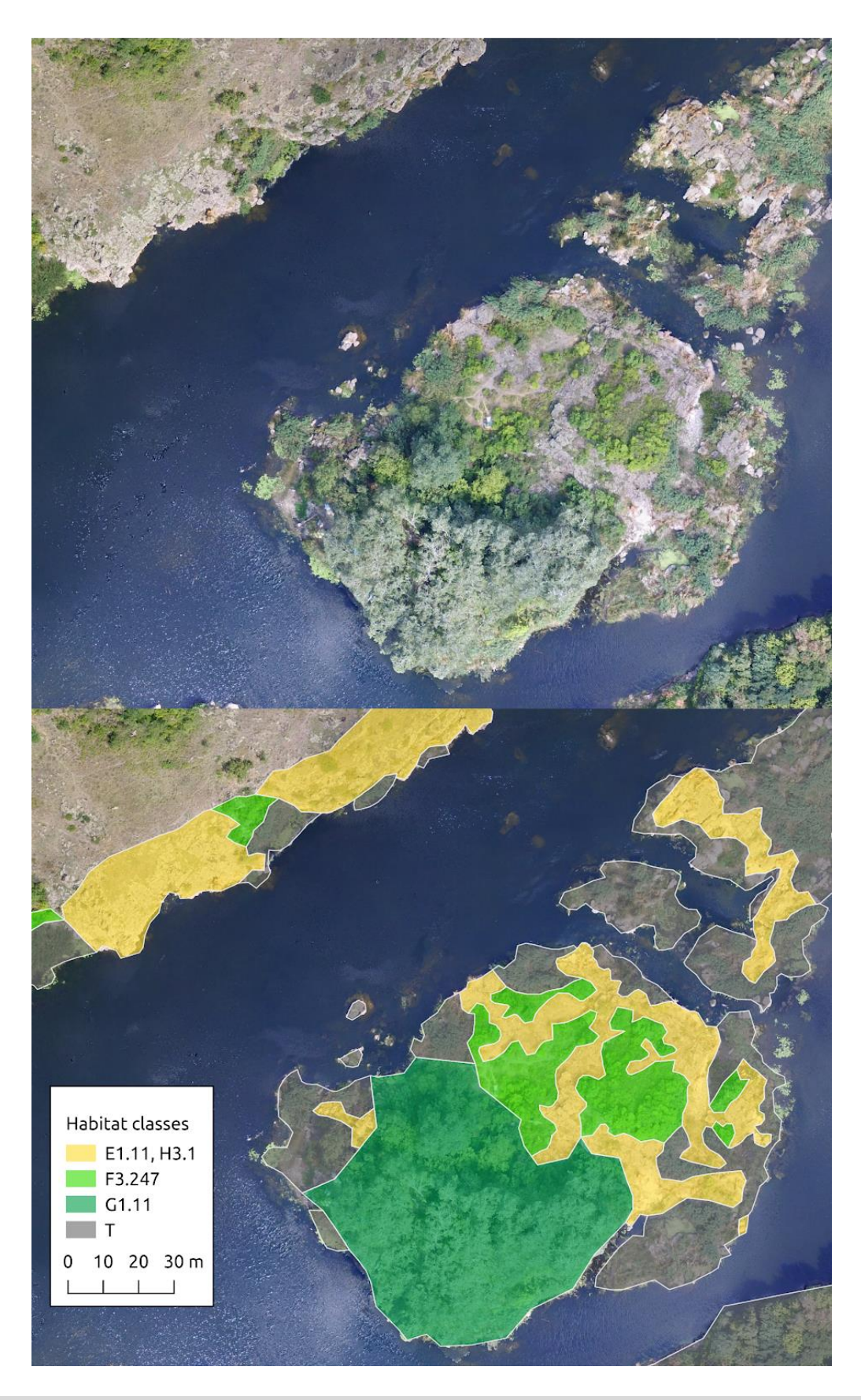
Fig. Natural boundary Gard, fragment of the drone orthophoto map (upper part) and habitat mapping (down part). Habitat types: E1.11 Euro-Siberian rock debris swards, H3.1 Acid siliceous inland cliffs, F3.247 Ponto-Sarmatic deciduous thickets, G1.11 Salix woodland. Class T combines all areas, which