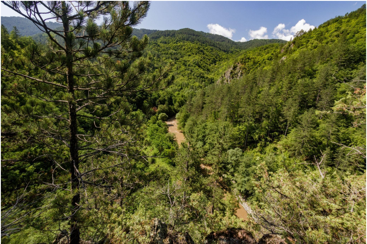
Studenica river and canyon just outside the Emerald site planned to be flooded, Photo: Tijana Jevtić 1