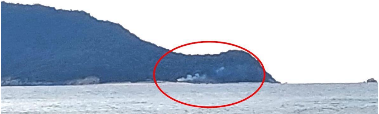
Marathonisi islet – protected area, February 20th. Smokes in red circles out of settin up fires in the protected forest area.

With roots back to 1983, MEDASSET was founded in 1988 in England and 1993 in Greece. It is an international NGO registered as a not-for profit organisation in Greece. MEDASSET plays an active role in the study and conservation of sea turtles and their habitats throughout the Mediterranean, through scientific research, environmental education, lobbying relevant decision makers and raising public awareness. The organisation is a partner to the United Nations Environment Programme's Mediterranean Action Plan (UNEP/MAP) and a Permanent Observer-Member to the Bern Convention, Council of Europe, since 1988.