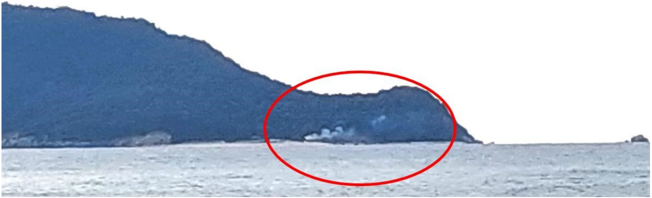
Marathonisi islet – protected area, February 20th. Smokes in red circles out of settin up fires in the protected forest area.

With roots back to 1983, MEDASSET was founded in 1988 in England and 1993 in Greece. It is an international NGO registered as a not-for profit organisation in Greece. MEDASSET plays an active role in the study and conservation of sea turtles and their habitats throughout the Mediterranean, through scientific research, environmental education, lobbying relevant decision makers and raising public awareness. The organisation is a partner to the United Nations Environment Programme's Mediterranean Action Plan (UNEP/MAP) and a Permanent Observer-Member to the Bern Convention, Council of Europe, since 1988.