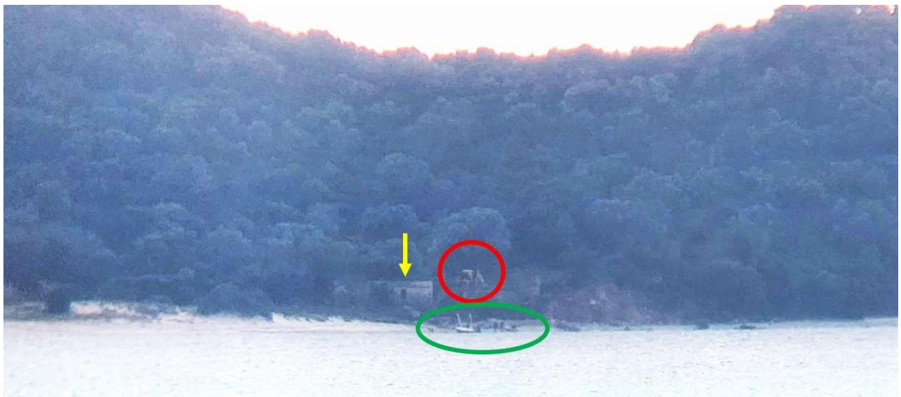
Marathonisi islet – protected area, February 19th. Heavy machinery (bulldozer) in red circle, boat and human presence in green circle and the building to be re-constructed in yellow arrow.