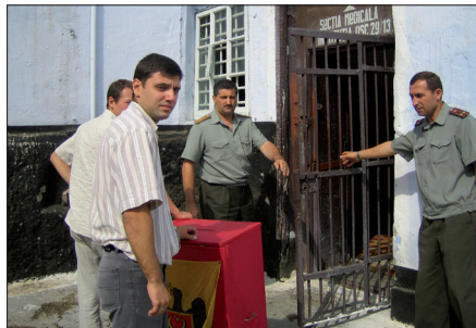
A ballot box in a prison in Chisinau (Moldova). Respect for civic rights, even in prison, is a sign of the quality of local democracy in a country.

Numerous legislative reforms have been set in motion by member states on the basis of the findings of these monitoring activities and the recommendations of the Congress.