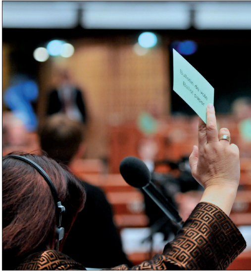
The free exercise of the functions of elected representatives is also expressed in their vote.

"[...] Local authorities shall be able to determine their own internal administrative structures in order to adapt them to local needs and ensure