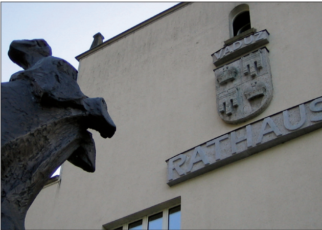
City Hall in Vaduz, during a local democracy monitoring mission in Liechtenstein.

The recognition of local democracy by the Council of Europe member states led in 1985 to the adoption of the European Charter of Local Self-Government. This text affirms the role of communities as the first level for the exercise of democracy. It has become the benchmark international treaty in this area.