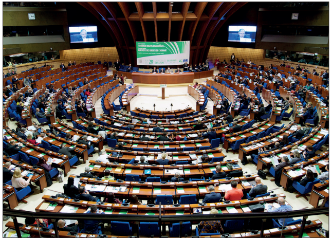
Monitoring reports are debated and adopted during Plenary Sessions of the Congress.

Administrative supervision of local authorities shall be exercised in such a way as to ensure that the intervention of the