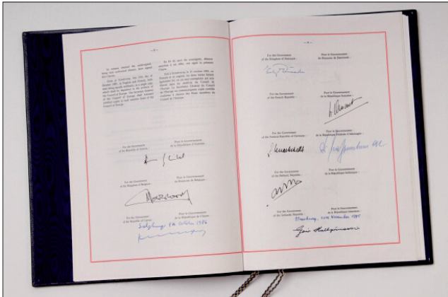
The original Charter kept by the Council of Europe Treaty Office.

The Charter requires that the principle of local self-government be embedded in domestic law and if possible in the Constitution in order to guarantee its effective implementation. It also lays down the principles of democratic functioning of communities.