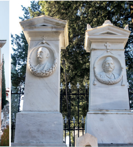
Ioannina, St Nikolaos Kopanon Cemetery