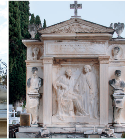
Nafplion, Municipal Cemetery