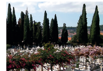
Kefalonia, Argostoli Cemetery