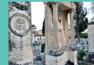
Tripoli, Metamorphosis Cemetery