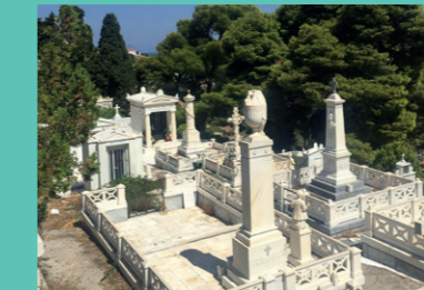
Andros, Municipal Cemetery of Chora