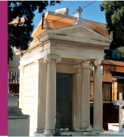
Chios, Municipal Cemetery

Dr Lina Mendoni Minister of Culture and Sports