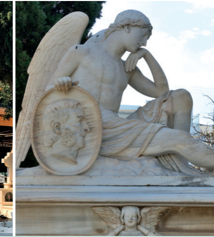
Syros, Hermoupolis Cemetery