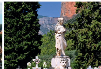
South Kynouria, All Saints Cemetery