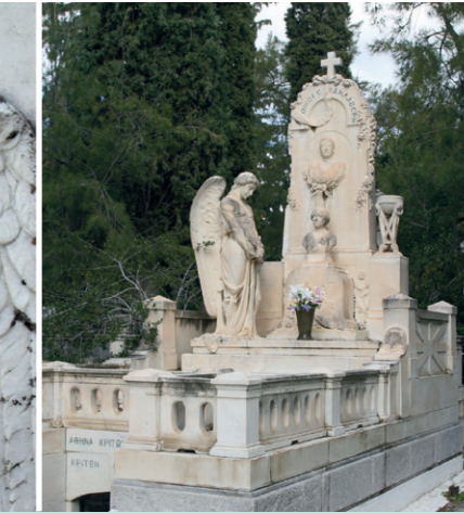
Piraeus, Cemetery of Anastasis