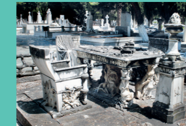
Volos, Taxiarches Cemetery