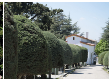
Kifissia, Municipal Cemetery