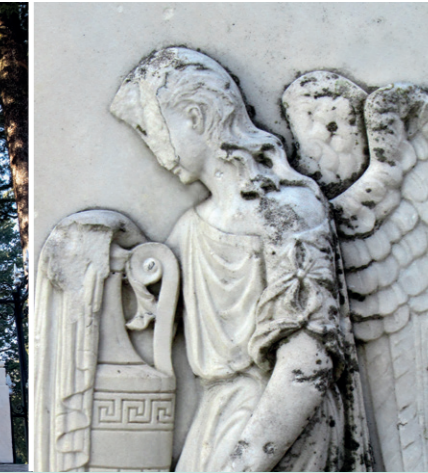
Skiathos, Municipal Cemetery