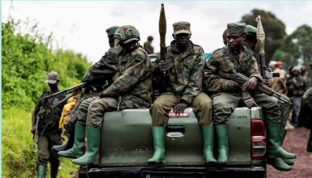
M23 rebels into Eastern of Democratic Republic of Congo (Kivu)

Rwanda and Uganda will not stop their attempts to control and loot North and South Kivu (for Rwanda) and the Ituri district of the Eastern Province (for Uganda) as long as Kinshasa is unable to protect its borders. As strong allies of the US in the "war against terror" in the region, and particularly in Sudan (where Rwanda has an important contingent in the UN/African Union peacekeeping force in Darfur) and in Somalia (where Uganda is leading the fight against the al-Qaida-affiliated al-Shabaab), they can count on US and UK support.