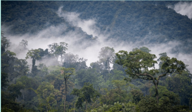
The second largest rainforest in the world Congo Basin under threat by fossil fuel multinational corporations

combined. A vast network of protected areas representing about 8% of the national territory preserves DRC's variety of ecosystems.