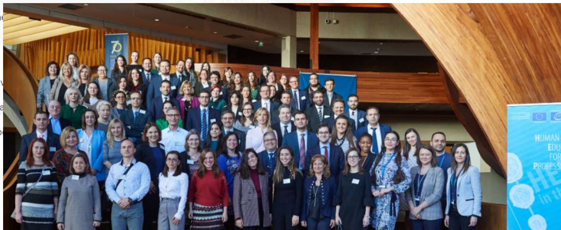
“HELP in the EU” cross border launch of the course Key Human Rights Principles in Biomedicine