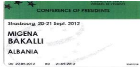
MEMBER OF DELEGATION