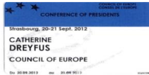
MEMBER OF STAFF – PACE – COUNCIL OF EUROPE

ACCESS TO THE PUBLIC GALLERY OF THE HEMICYCLE IS STRICTLY RESERVED FOR PHOTOGRAPHERS AND CAMERAMEN OF DELEGATIONS, DULY ACCREDITED WITH THE COMMUNICATIONS DIRECTORATE OF THE COUNCIL OF EUROPE