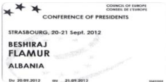
TECHNICAL SERVICE (Interpreter, journalist, photograph, security officer)