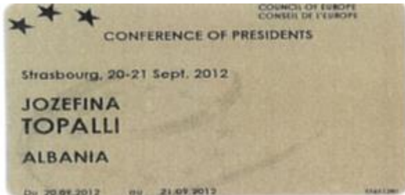
PRESIDENT – VICE-PRESIDENT OF PARLIAMENT

For your information, here are the Conference badge categories.