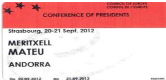
MEMBER OF PARLIAMENT