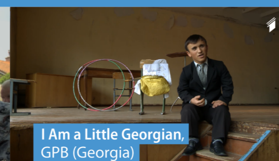
I Am a Little Georgian, GPB (Georgia)

🏆 Prix CIRCOM 2014; NL Award for Best Documentary; Film Critics Award at 2013 Dutch Film Festival (nomination)