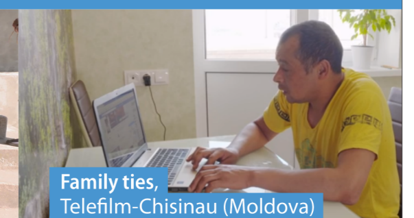
Family ties, Telefilm-Chisinau (Moldova)

🏆 2018 ADAMI Media Prize for Cultural Diversity in Eastern Europe