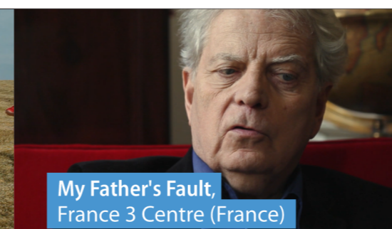
My Father's Fault, France 3 Centre (France)