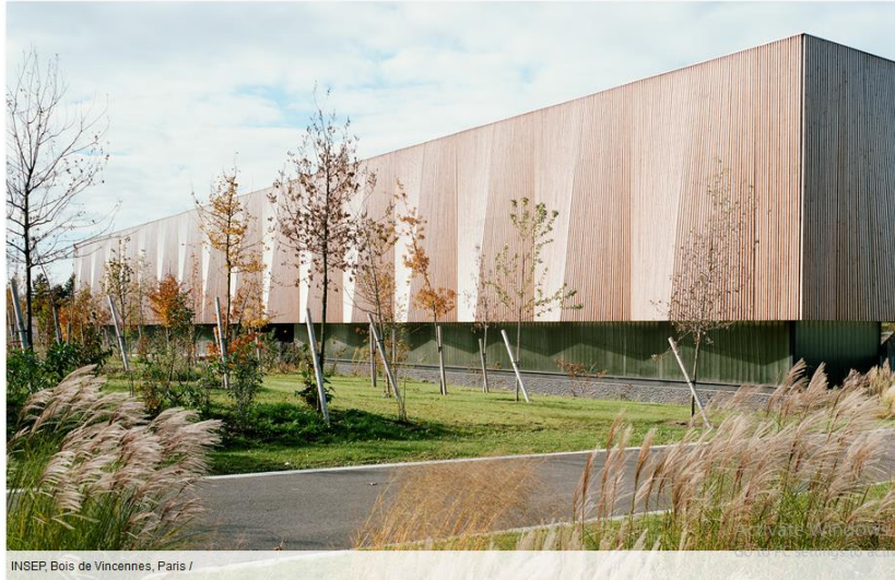
INSEP Bois de Vincennes, Paris /

Activate Windows Go to PC settings to activate Windows.