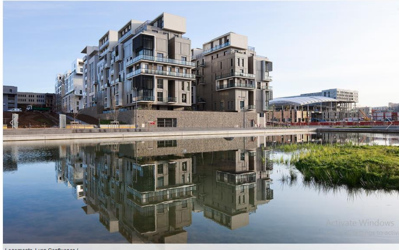
Ensembles : L'Ann Confluence /

Activate Windows Go to PC settings to activate Windows.