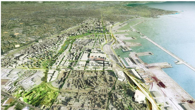
Extension du périmètre d'Euromed, 169 hectares /

Activate Windows Go to PC settings to activate Windows.