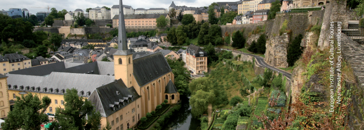
European Institute of Cultural Routes Neumünster Abbey, Luxembourg