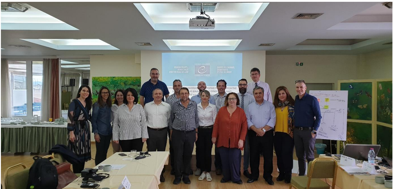
Picture 1: Workshop on Inter-Municipal Cooperation for Internal Audit (Larissa, November 2019)

limitations regarding financial and human resources. The project was implemented by the Centre of Expertise for Good Governance of the Council of Europe, with co-funding from the DG REFORM of the European Commission and in close cooperation with the Ministry of Interior, the National Transparency Authority and the National Center of Public Administration and Local Government. The Centre of Expertise was supported by two national partner institutions specialised in local governance - the Hellenic Agency for Local Development and Local Government, and the Regional Development Institute of the Panteion University.