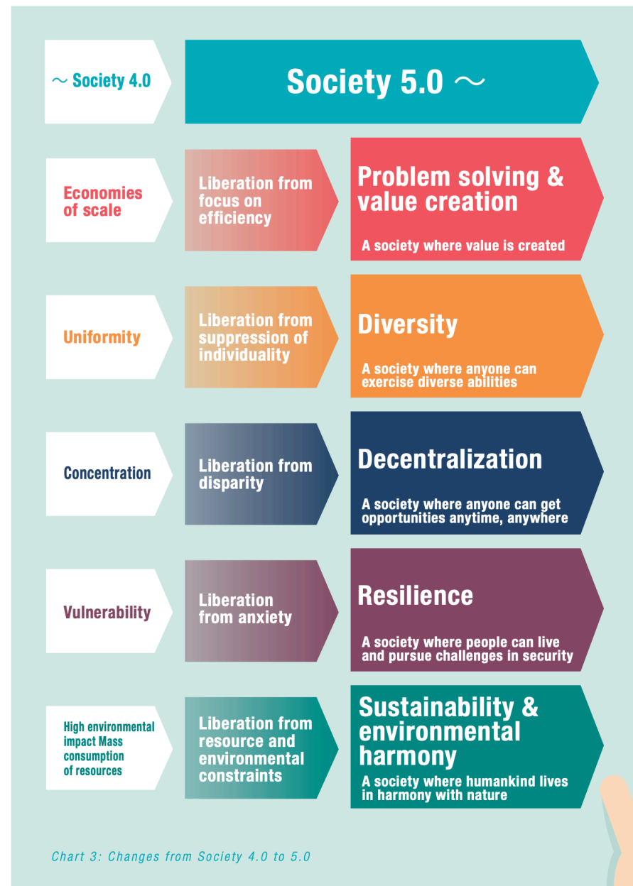
Chart 3: Changes from Society 4.0 to 5.0

As everyone accesses advanced "abilities" in Society 5.0, they will be liberated from various constraints that could not be overcome up to Society 4.0, and will obtain the freedom to pursue diverse lifestyles and contribution to the society.