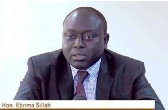
Minister of Information & Communication Infrastructure