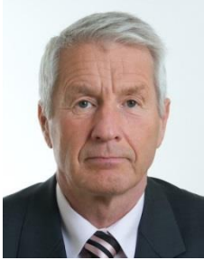
Thorbjørn JAGLAND Secretary General of the Council of Europe

Mr Thorbjørn Jagland is the 13th Secretary General of the Council of Europe. The Secretary General has the overall responsibility for the strategic management of the Organisation. Mr. Jagland was elected in September 2009. In June 2014, he was re-elected, and his second term in office commenced on October 1, 2014. The former Prime Minister and Foreign Minister of Norway, Thorbjørn Jagland, aged 65, was also the President of the Storting (Norwegian Parliament) and the leader of the Norwegian Labour Party. He is a member of the Norwegian Nobel Committee.