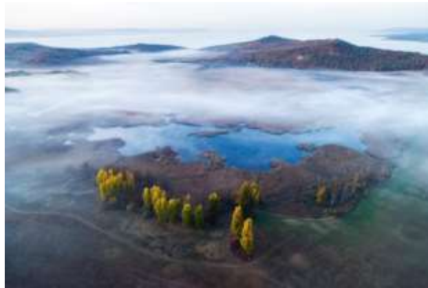
Autumn morning at Lake-Külső / Balaton-highland National Park (Magical Hungary)

PHOTO EXHIBITION – Selection of photos of “Magical Hungary”