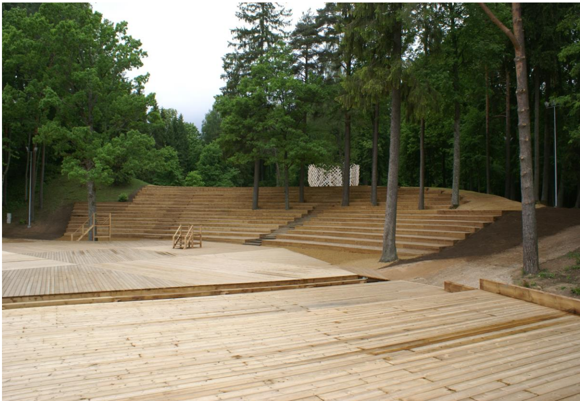
Picture Nr. 9 – Neikenkalns Nature concert hall (Author: Koceni Municipality )