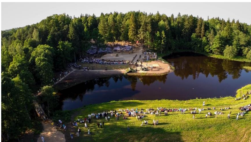
Picture Nr. 3 – Nature Concerte Hall. Water body is similar to shape of Latvia.