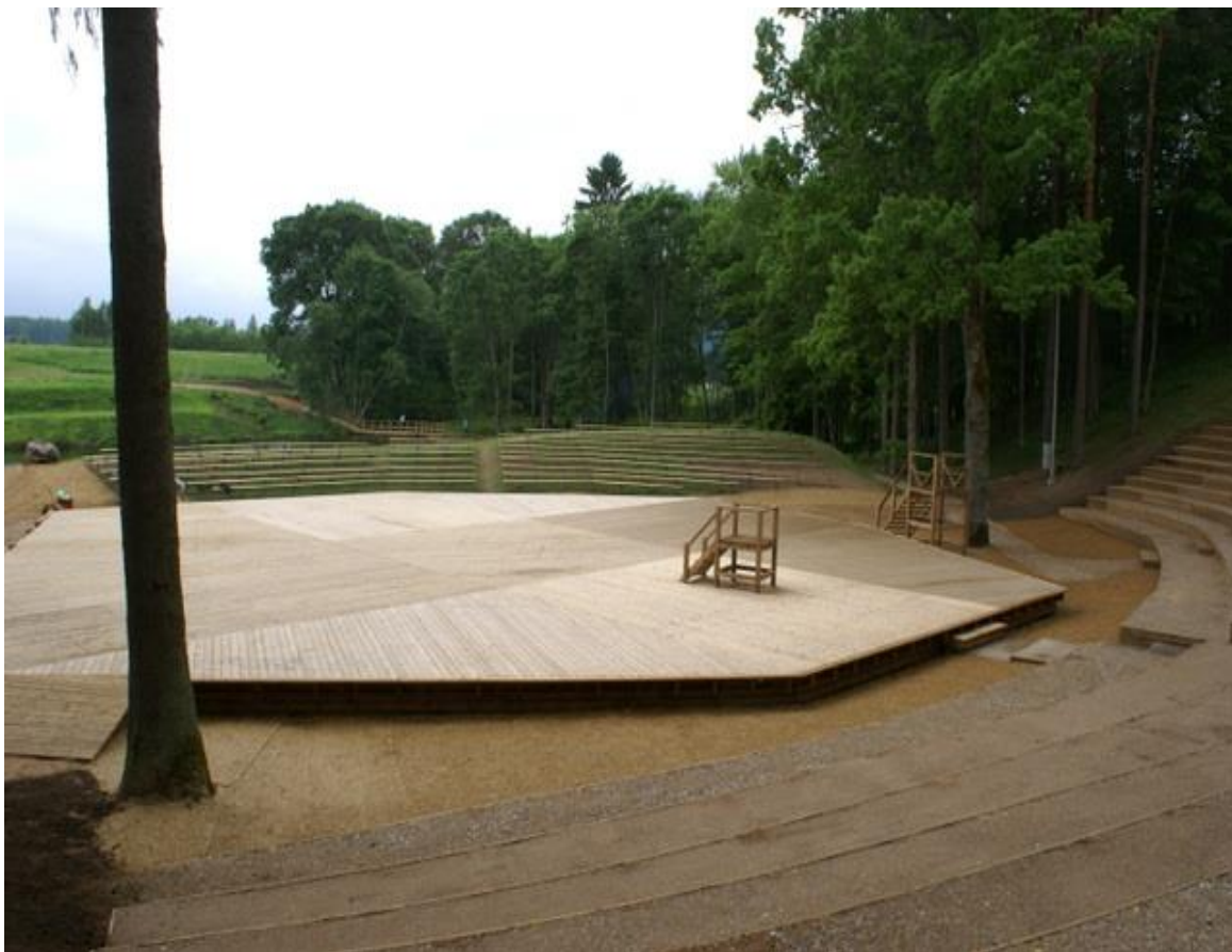
Picture Nr. 10 – Neikenkalns Nature concert hall (Author: Koceni Municipality)