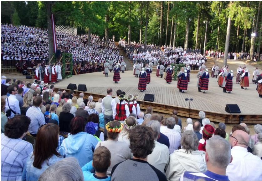
Picture Nr. 6 – Events in Neikenkalns Nature concrete hall