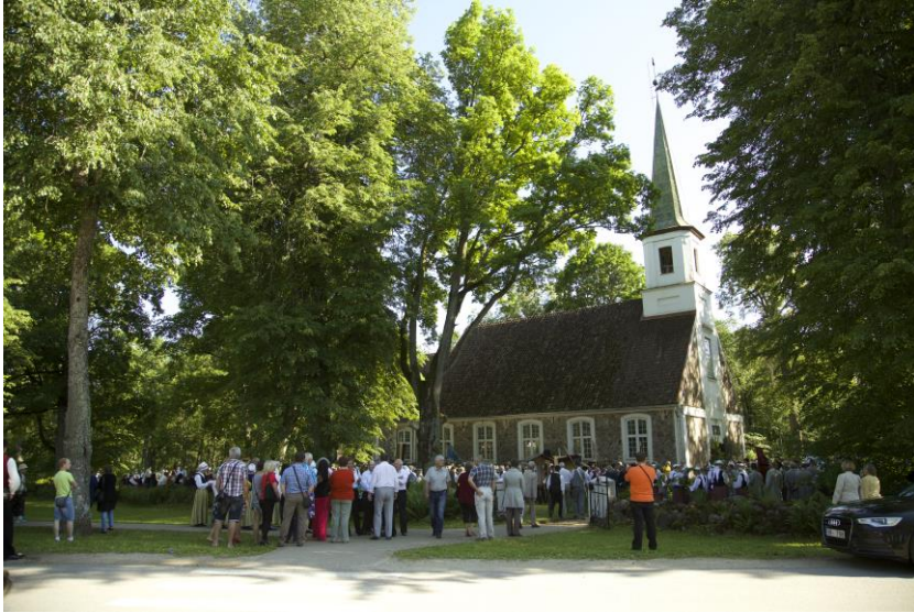
Picture Nr. 5 – Dikļi Evangelic Lutheran Church (Author: Koceni Municipality )