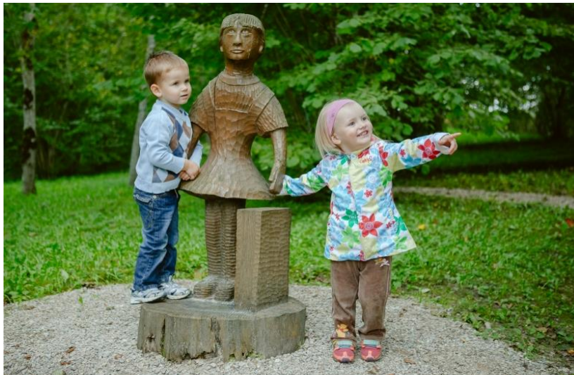
Picture Nr. 8 – Wooden sculpture park in Dikli (Author: Koceni Municipality )