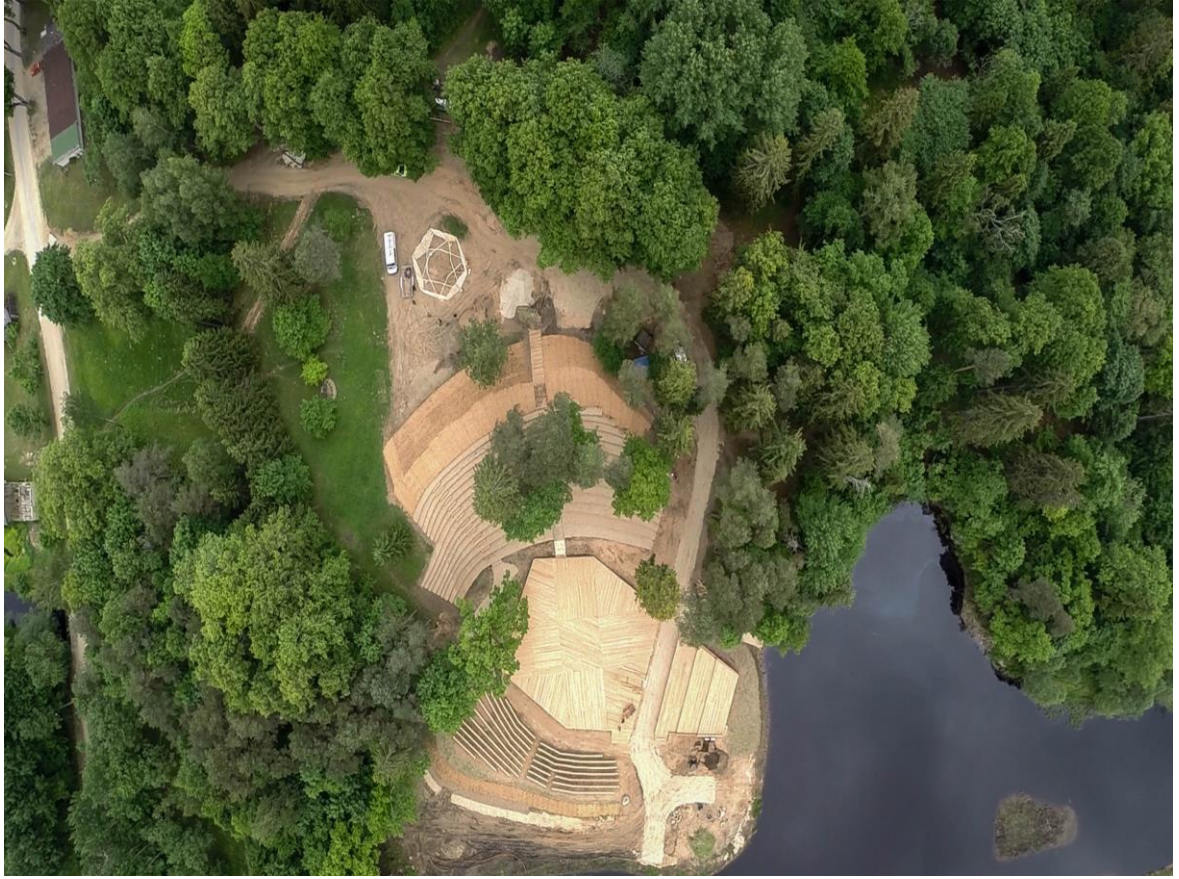
Picture Nr. 11 – Neikenkalns Nature concert hall (Author: Koceni Municipality )