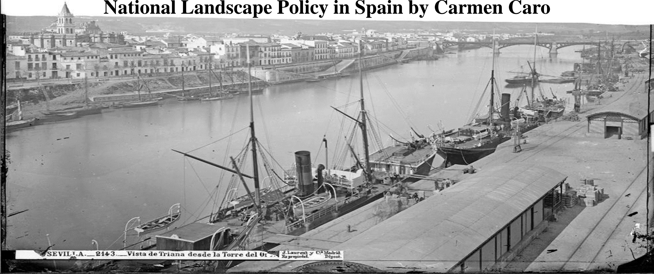
SEVILLA. — 2143. — Vista de Triana desde la Torre del Oro.