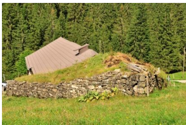
Fig. 69. Near L'Étivaz, Pays d'Enhaut (Vaud), Switzerland