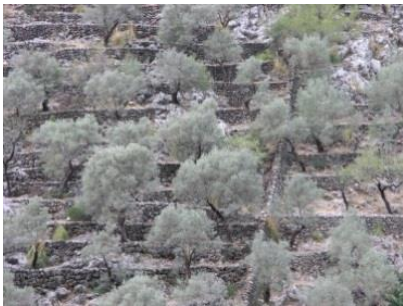
Fig. 38. Majorca, Spain.