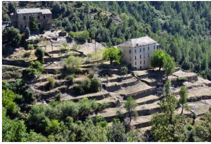
Fig. 34. Castagniccia Valley, Corsica, France.