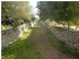
Fig. 86. Catalonia, Spain.