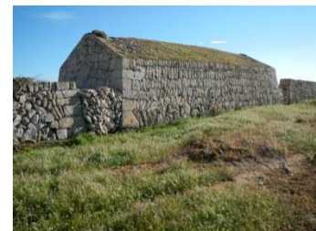
Fig. 73. Shelter for livestock ( pont de bestiar ), Minorca, Spain.