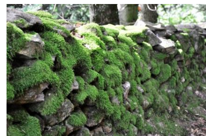
Fig. 19. Moss on a north-facing wall in Molompize (Cantal), France.

Dry stone walls thus play a part in the functioning of ecological corridors and they must be considered when addressing the issues raised by green and blue belts and planning tools.