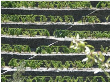
Fig. 113. Alto Douro, Portugal.

above the confluence of the Rhine and the Moselle in Germany or those of the Valais in Switzerland. Only a few of these landscapes have been recognised by UNESCO: Cinque Terre and the Amalfi coast in Italy, the Alto Douro in Portugal, Lavaux in Switzerland and the Serra de Tramuntana on the island of Majorca. Yet, while they have obtained their listing because of the authenticity of their terraces, underscored by the dry stone walling, oddly enough nothing requires these walls to be maintained or restored to their original condition. When we travel across these unique sites and look more closely, it becomes apparent, sadly, that the failure to include these structures in the site specifications is sometimes a factor in their replacement by other methods of building, thus leading purely and simply to their disappearance and hence diminishing the beauty of the landscape.