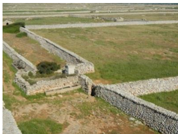
Fig. 40. Punta Nati near Ciutadella (Minorca), Spain.