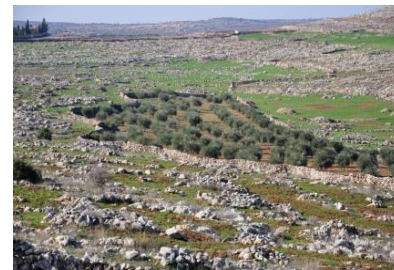
Fig. 23. Limestone plateau, north-west of Aleppo, Syria (2009).