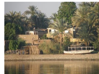
Fig. 102. River Nile, Egypt.