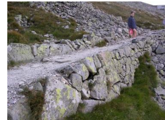
Fig. 110. Zakopane, Tatra National Park, Carpathian Mountains, Poland.