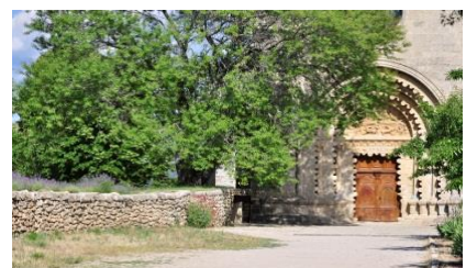
Fig. 53. Priory at Ganagobie (Alpes-de-Haute-Provence), France.