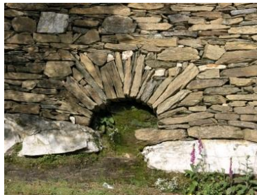
Fig. 15. Wall by Marc Dombre, Saint-Germain-de-Calberte (Lozère), France.