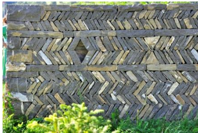
Fig. 13. Wall by Urs Lippert, Switzerland.