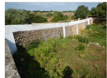
Fig. 8. Bottom of a communal garden, acting as a barrier across a small valley leading to the sea, Ciutadella de Menorca (Minorca), Spain.

Building a dry stone wall requires patient, precise work. Contemporary wallers, many of whom resist standardisation, are artists who leave their mark on their stonework: not only are their joints different, but their work also includes an original compositional detail based on the colour or shape of the stones. The international land artist Andy Goldsworthy works with the best British wallers when creating his works all over the globe.