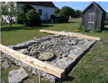
Fig. 66. Base of a chalet, Island of Gotland, Sweden.