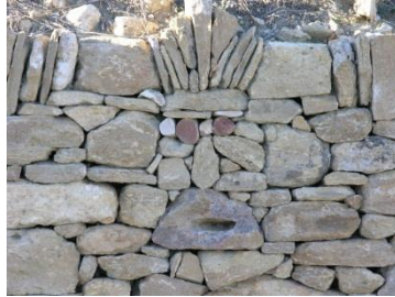
Fig. 11. Restoration of a retaining wall in Oppède-le-Vieux, Luberon (Vaucluse), Maison des Métiers du Patrimoine work experience project.