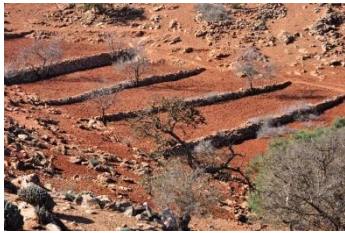
Fig. 99. Building across the valley to the south of Tiznit, Anti-Atlas Mountains, Morocco.