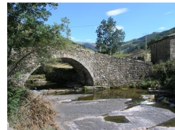
Fig. 85. Navarre, Spain.