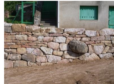
Fig. 14. Wall by Laviers et Murailleurs de Bourgogne (Burgundy Stone Roofers and Wallers), France.