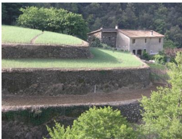
Fig. 27. Surroundings of Saint-Martial (Gard), France.