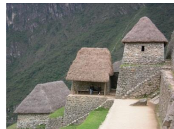
Fig. 2. Building with available materials: stone, wood, thatch. Reconstruction at Machu Picchu, Peru (2007).