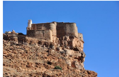
Fig. 77. Amtoudi oasis, Anti-Atlas Mountains, Morocco.