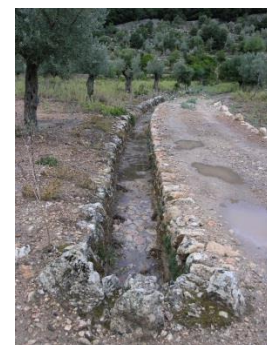
Fig. 106. Majorca (Balearics), Spain.