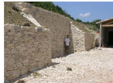
Fig. 61. Blauzac (Gard), France. Built by Vincent Mougel, waller.