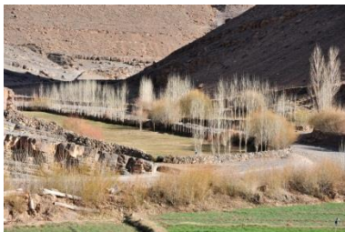
Fig. 22. Near Imilchil, High Atlas, Morocco.