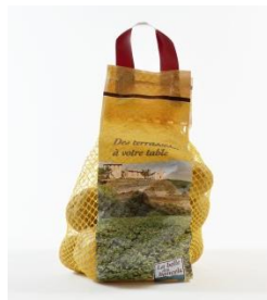
Fig. 28. www.oignon-doux-des-cevennes.fr