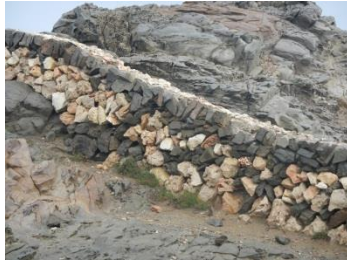
Fig. 9. Polychromatic stonework in walls, Minorca, Spain.