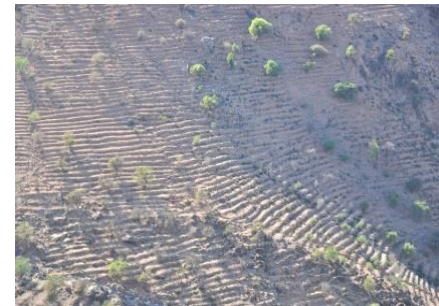
Fig. 39. Between Aït Baha and Tafraout, Anti-Atlas Mountains, Morocco.