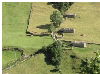
Fig. 42. Paz Valley (Asturias), Spain.