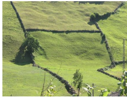
Fig. 117. Paz Valley, Asturias, Spain.

The next step must be to include this concern in planning documents, with the aim of ensuring that dry stone walling's role in the landscape is properly recognised.