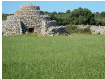
Fig. 72. Dry stone wind shelter ( barraca ), Minorca, Spain.