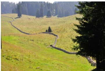
Fig. 115. Jura, France.