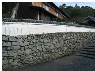
Fig. 7. Nara (Kansai region), Japan.