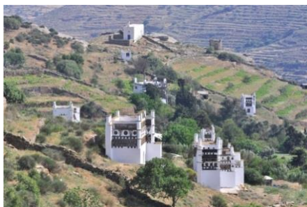
Fig. 24. Dovecotes, Tinos, Greece.