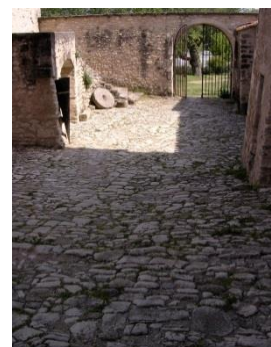
Fig. 63. Salagon Priory, Mane (Alpes-de-Haute-Provence), France