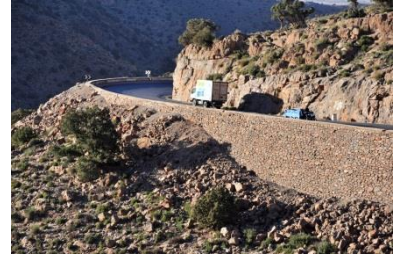
Fig. 81. Near Midelt, Atlas Mountains, Morocco.