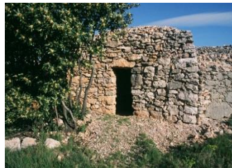
Fig. 74. Shelter in a vineyard wall, Saint-Chinian (Hérault), France.