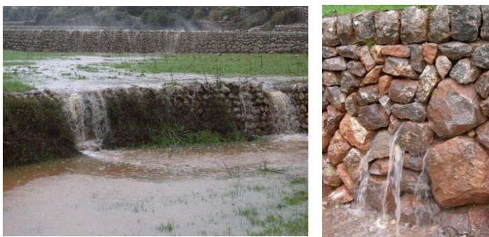
Figs. 25-26. Walls after a storm in Majorca.

The concern is to forestall deterioration of terraces, prevent their abandonment and encourage their restoration. In Majorca, where violent storms occur, but only occasionally, the terraces – to play their retention role – sometimes have double-skinned retaining walls constituting a particularly thick structure (approximately 80 centimetres broad at the top) and contain ingenious drainage systems to remove surplus water, guiding it towards small, very carefully-built irrigation channels.