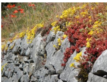
Fig. 18. Sedum flowers on a south-facing wall in Saint-Trinit, Plateau d'Albion (Vaucluse), France.