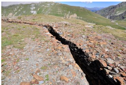
Fig. 111. Austro-Hungarian military trenches, Val Venosta, Italy.