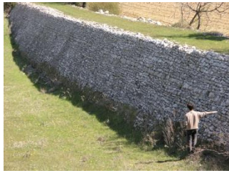
Fig. 97. Double-skinned dam ( restanque ) barring a valley, Switzerland. The waller is pointing to his work.

radical means of breaking the slope and at the same time limiting the force of the water. Rivers also have dams – or crests – barring the valley.