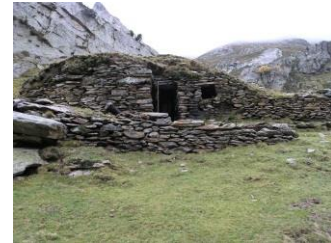
Fig. 75. Former mountain shepherd's huts ( orri ) above the Videssos Valley (Ariège), France.