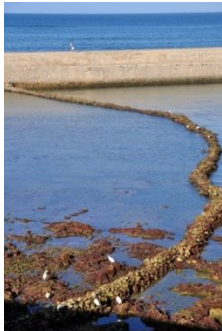
Fig. 94. Fishery (fish trap), El Jadida, Morocco.