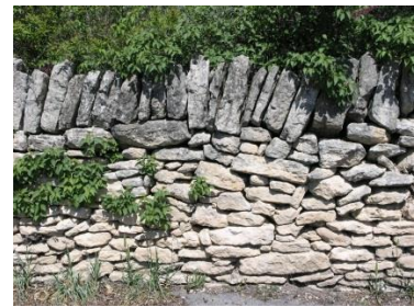
Fig. 6. Gordes, Luberon (Vaucluse), France.