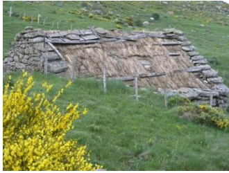
Fig. 71. Earth-bermed house with broom thatched roof, Lozère, France.