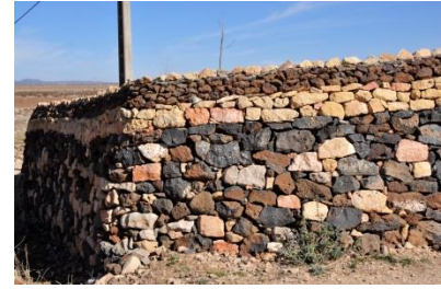
Fig. 10. Polychromatic stonework in walls, near Midelt, Middle Atlas, Morocco.