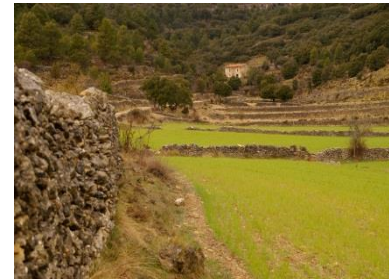
Fig. 21. Vilafranca (Castellón), Spain.