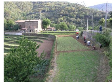
Fig. 29. Surroundings of Saint-Martial (Gard), France.

The ProTerra programme also helped to defend the farming community by getting the designation of farmer ( agriculteur ) extended to cover smallholders, a status previously denied them because their holdings were thought too small to live off: