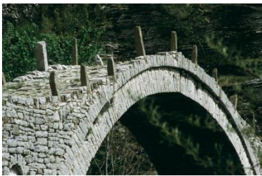
Fig. 84. Epirus, Greece.