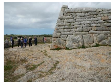
Fig. 4. Megalithic chamber tomb in Minorca ( Naveta d'Es Tudons , Bronze Age), Spain.

From time immemorial wherever there has been stone there have been dry stone structures. Human beings have sought to meet their needs by making do with whatever natural materials they found to hand: wood, straw, earth or stone. Thus, depending on geography, they have levelled hills to make their homes and farm the slopes, building fences and walls to mark ownership as well as to protect their crops and keep their animals in. They have also made paved pathways to drain the ground and prevent mud from accumulating around the village fountain and in their farmyards, along mule tracks and in street gutters. They have collected water to channel to their crops and distribute fairly to everyone; they have battled erosion by building drainage barriers across valleys to slow the destructive run-off from the melting of the snow or from heavy rainfall. These barrier systems for controlling soil erosion caused by hillside run-off act as detention basins and are therefore particularly fertile places