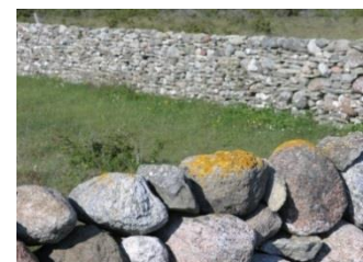
Fig. 43. Island of Gotland, Sweden.