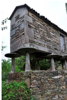
Fig. 76. Galicia, Spain.