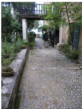
Fig. 62. Majorca (Balearics), Spain.