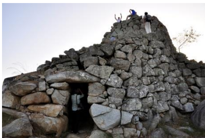
Fig. 3. Nuraghe in Sardinia (Bronze Age), Italy.