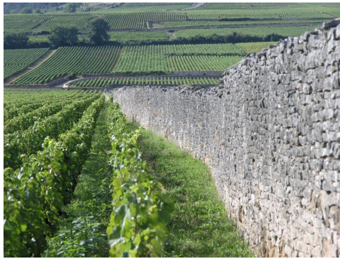
Vineyards in Burgundy