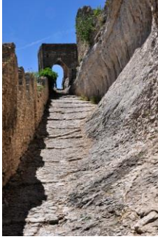
Fig. 90. Ascent to castle, Saint-Saturnin-lès-Apt, Luberon (Vaucluse), France.