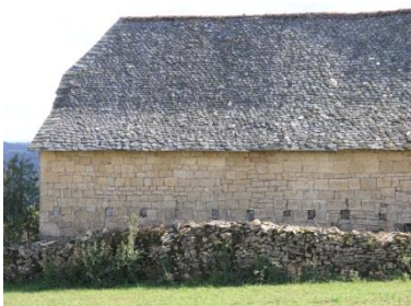
Fig. 50. Aveyron, France.