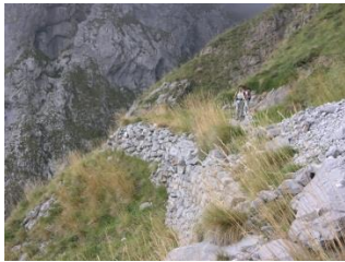
Fig. 109. Peaks of Europe ( Picos de Europa ), Asturias, Spain.