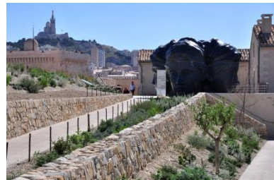
Fig. 47. First prize in the 2014 Victoires du Paysage landscape competition in the “Urban Garden” category: Jardin des Migrations, Fort Saint-Jean, Marseille, France. Design: APS, Valence. Construction: Les Murailleurs de Provence, trainers for the Acta Vista work experience scheme.