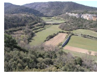
Fig. 98. Farming landscape formed by double-skinned dams ( restanques ), Venasque, Monts de Vaucluse, France.