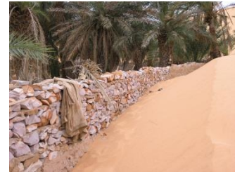
Fig. 108. Chinguetti, Mauritania.