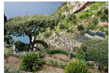
Fig. 116. Amalfi coast, Italy.

Lack of knowledge is often the cause of damage to landscape, as it is to architecture. Good intentions, or, more venally, a purported (short-term) profit, can irremediably sacrifice the richness and diversity of landscape composition, shaped over centuries of toil. These age-old methods of construction are fascinating for their adaptability to the climate, relief and local resources.