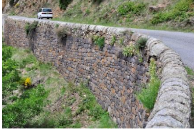
Fig. 80. Eastern Pyrenees, France.