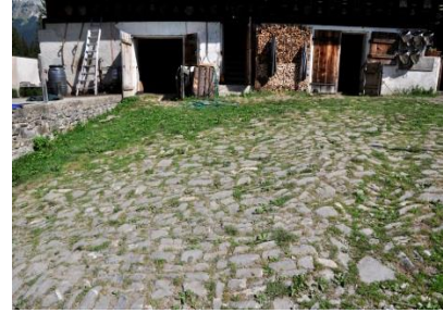
Fig. 65. Farm near L'Étivaz, Pays d'Enhaut (Vaud), Switzerland.