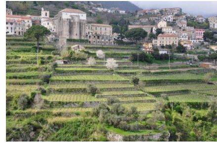
Fig. 35. Amalfi coast, Italy.