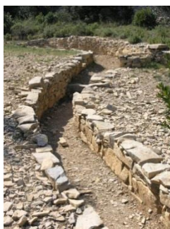
Fig. 105. Combe des Bourguignons, Marguerittes (Gard), France.