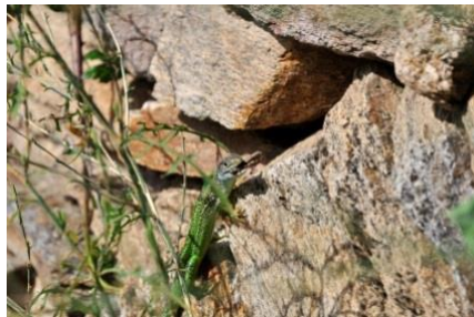
Fig. 17. Lizard in Molompize (Cantal), France.

Depending on its nature, stone can act as a sponge. As with moss, lichens and fungi concentrate radioactivity and thus, by extension, pollution. Since stone is used to balance the pH value of water in natural swimming pool systems, do stones not have a filtering function too? Bearing in mind the issues raised by climate change, thermal cameras measuring urban heat islands have shown that a single tree is able on its own to lower the temperature in its shade by at least 3°C. The benefit of building dry stone walls should also be considered from this angle.