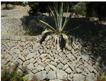
Fig. 5. Private garden in Toulon (Var), France.

A dry stone wall is a gravity wall, with the weight helping to stabilise the structure. The coping stones can be placed either flat or on edge. An upright stone coping means that more stones can be used to provide this weight. This method deters animals (mainly goats) from jumping or climbing the wall. In Minorca (Spain) the lack of large stones has been solved by a coping roughly 30 cm high consisting of small stones coated with lime mortar and then whitewashed. Similar practices are found in Kyoto and Nara in Japan. A coping dislodged by the passage of animals may well collapse, with wild boars often being to blame. Care is therefore needed when replacing a coping stone. This knowledge and wallers' ability to remember the characteristics of the stones that they have sorted previously, together with their skill – sharp eyes and sure hands – in finding the right place for each stone, mature with practice over the years. Wallers' fingers and forearms, used to carry the stones and turn them round and over when choosing the shape that will best fit the spaces to be filled and the stones to be pinned, are very muscular.