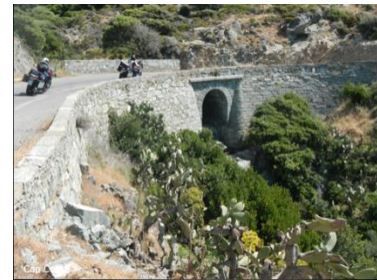
Fig. 83. Cap Corse, France.