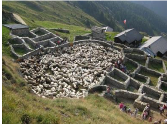
Fig. 32. Sheep sorting pens for the end of mountain pasturing in Belalp, Aletsch Glacier above Brig, Switzerland. Restored by Stoneworks Lippert.

An attractive farming landscape is undeniably a sign that good farming practice has been followed and high-quality local produce is being grown; it thus helps to give people pride and reflects the quality of work that preserves the ecosystem balance and is consistent with the rhythm of the seasons, crops, soil, trees, etc.