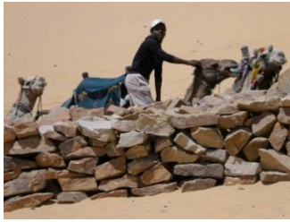
Fig. 107. Aswan, Egypt.