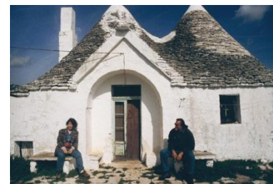
Fig. 70. Farm near Noci (Apulia), Italy.