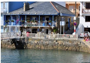
Fig. 101. Galicia, Spain.