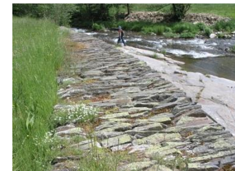
Fig. 104. River Lot, Saint-Julien-du-Tournel (Lozère), France.