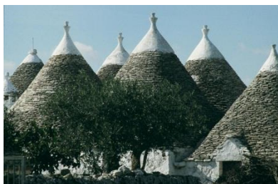
Fig. 69. Farm near Alberobello (Apulia), Italy.