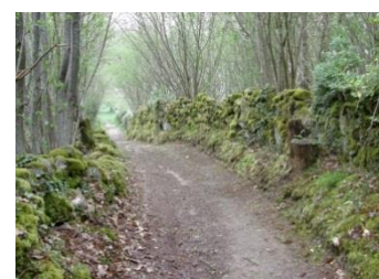
Fig. 89. Muddy sunken road to drain rainwater and protect grazing for Limousin cattle, Masgot (Creuse), France.