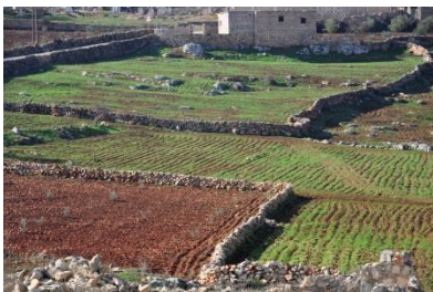
Fig. 1. Traditional crops in Syria (2009).