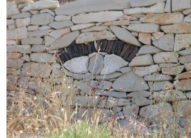
Fig. 12. Mediterranean high-speed line (TGV Méditerranée) embankment slope, Tavel (Gard), France. Built by Opus Patrimonio.