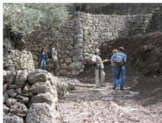
Fig. 88. Near Sóller (Majorca), Spain.