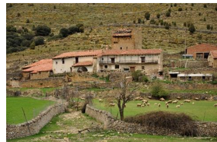
Fig. 51. Castellón, Spain.