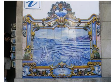
Fig. 114. Promoting the landscape in a glazed tile in Pinhão Station, Alto Douro, Portugal.