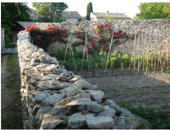
Fig. 46. Tavel (Gard), France.