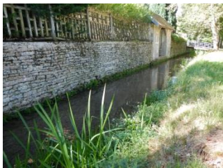
Fig. 103. North of Dijon (Côte-d'Or), France.