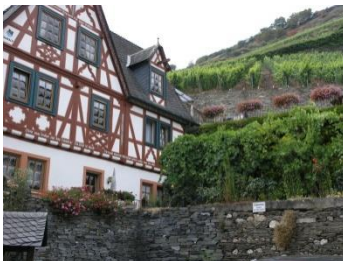
Fig. 60. Moselle Valley, Germany.