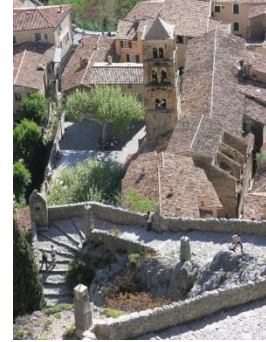
Fig. 91. Ascent to chapel, Moustiers-Sainte-Marie (Alpes-de-Haute-Provence), France.