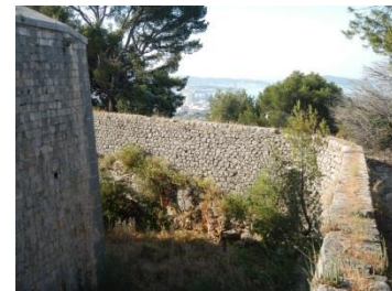
Fig. 112. Moat of a former outlook over the Toulon roadstead, Mont Faron, Toulon (Var), France.