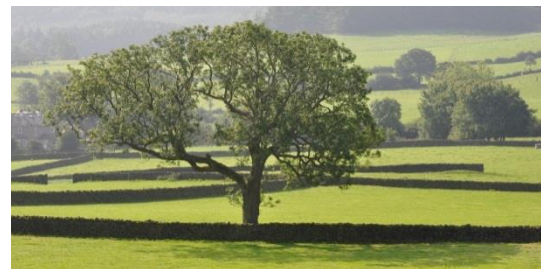
Fig. 41. England, United Kingdom