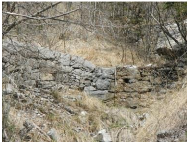
Fig. 20. Chorges (Hautes-Alpes), France.