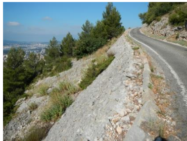
Fig. 82. Mont Faron, Toulon (Var), France.