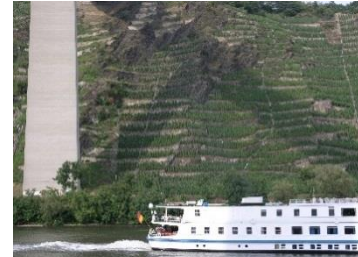
Fig. 33. Moselle Valley at the confluence with the Rhine, Germany.

In Germany, the vineyards of the Moselle Valley up to its confluence with the Rhine are set out in narrow terraces on the south-facing slope, the slope with the most exposure to the sun. It is climbed by a system of little monorail trains, borrowed from the Swiss, enabling the vines and walls to be looked after, and it also facilitates the harvest. Some tourists take the river boats for excursions, while other sportier ones follow the cycle path along the river. Tours of the Moselle Valley are very popular. Each village is a gourmet stopping place, where cafés and restaurants offer Moselle wine tastings on their terraces, accompanied by charcuterie and grilled sausages with potatoes ( Bratwurst und Kartoffeln ).