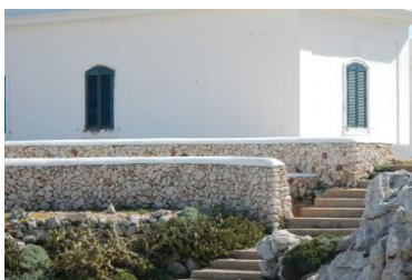
Fig. 52. Minorca, Spain.