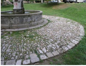
Fig. 64. Fountain, Aveyron, France.