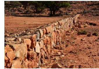
Fig. 100. Detail of structure, south of Tiznit, Anti-Atlas Mountains, Morocco.