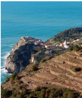
Fig. 30 and Fig. 31. Cinque Terre (Liguria), Italy.

For instance, the steep terraced vineyards of Cinque Terre in Italy offer a unique landscape with their villages perched on sheer cliffs plunging into the sea. Cars belonging to non-residents are prohibited. Visitors therefore have to take the train or walk. The vineyards' success is such that bottles of wine are often sold before the grapes are even harvested.