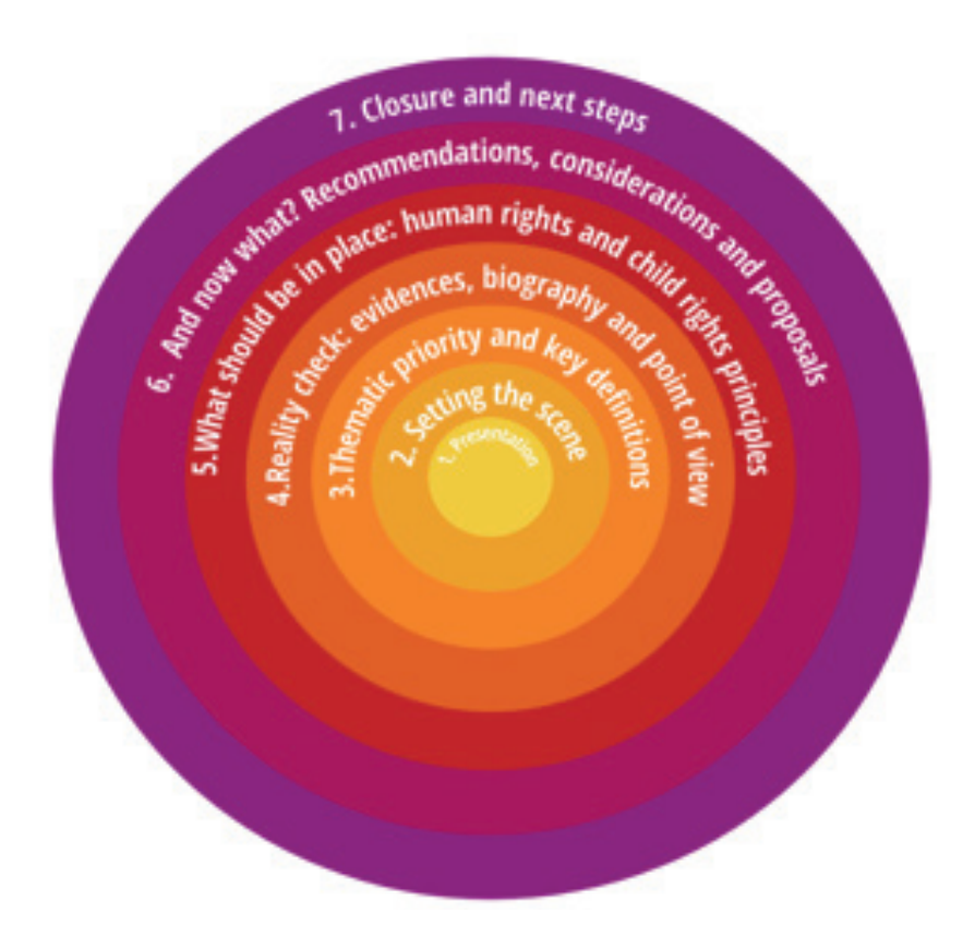
Figure 1: Steps of the consultation process

The first step, introduction of participants , aimed at creating an informal, safe and child-friendly common framework allowing the children to feel at ease. Through a narrative biographic exercise, participants established a personal connection with the theme of the consultation. This exercise helped participants to get to know each other and to 'warm up' for their subsequent interaction and collaboration.