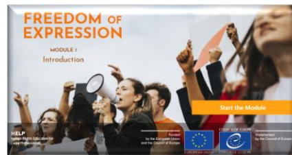
Freedom of Expression (updated course)