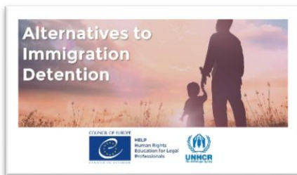
Alternatives to Immigration Detention