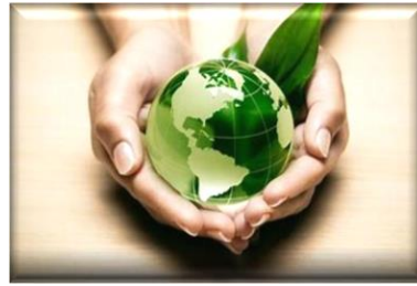
Environment and Human Rights