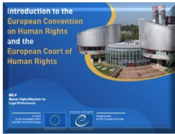
Introduction to the ECHR and the ECtHR (updated), with an entirely new module on Execution of Judgments of the ECtHR

The following newly developed/updated HELP courses will be presented to the participants: