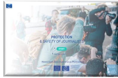
Protection and Safety of Journalists