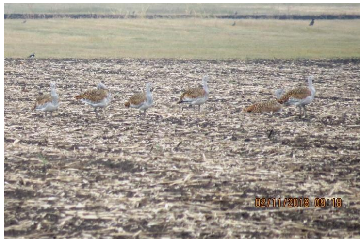
Figure 2. Great bustard at the "Weilerka" site November 2018