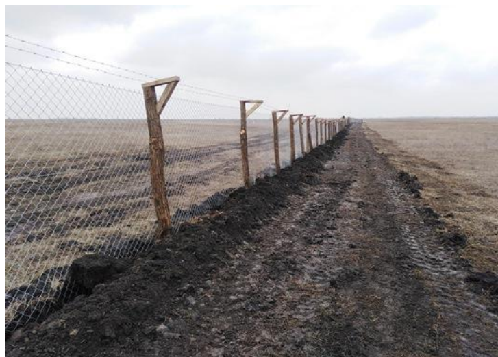
Figure 4. Guardrail for the great bustard built in SRP "Pastures of great bustard"