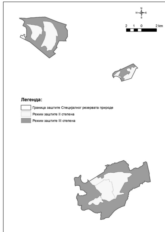
Figure 1: Zoning system – protection regime of the second (II) and third (III) level of the protection