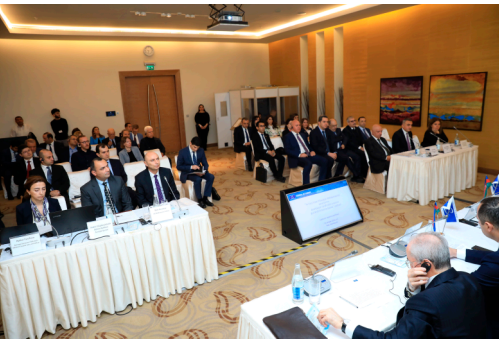
Launching event of the project on Support for the Improvement of the Execution of the European Court Judgments by Azerbaijan (Baku, 21 October 2022)

Training of legal professionals is one of the priorities under the successive Action Plans for Azerbaijan. The Council of Europe provided assistance to national training institutions, such as the Justice Academy. Under the Council of Europe Human Rights Education for Legal Professionals Programme (HELP), 50 lawyers were awarded HELP certificates for the courses on European Court of Human Rights procedures and admissibility criteria. A new project on “Support for the Improvement of the Execution of the ECtHR Judgements by Azerbaijan” was launched on 21 October 2022.