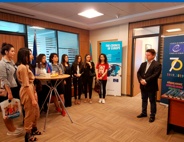
Open Day in the Council of Europe Office in Baku on the occasion of the 70th Anniversary of the Council of Europe (Baku, 5 May 2019)

The implementation of co-operation activities is supported and co-ordinated by the Office of the Council of Europe in Baku.