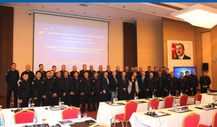
Training on Standards of Processing and Respect for Detainees' Rights for a Better Detention Service organised by the Council of Europe in partnership with the Ministry of Internal Affairs of the Republic of Azerbaijan (Baku, 26-27 April 2022)

*2 - This project funded by the European Union and the Council of Europe and implemented by the Council of Europe