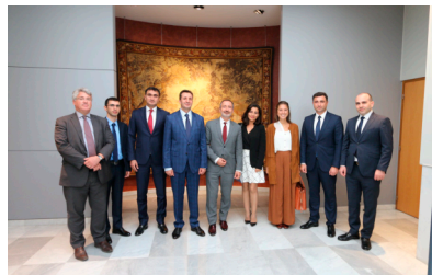
Study visit to explore private enforcement system in France and the Netherlands (Paris, 16-19 September 2019)

As a result of the work under the Action Plans and in particular the EU/Council of Europe Partnership for Good Governance project on Strengthening the Efficiency and Quality of the Judicial System, capacities of the national institutions were improved in court management-related areas, a road map was established for the dissemination of the European Commission for the Efficiency of Justice (CEPEJ) tools among the Azerbaijani courts, tools on access to courts for vulnerable groups and on the communication strategy for the judiciary were developed and support for reform of the judgements enforcement system was launched.