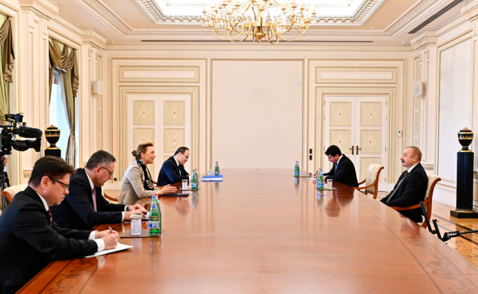
Meeting of the Secretary General of the Council of Europe, Ms. Marija Pejčinović Burić with the President of the Republic of Azerbaijan, H.E. Mr. Ilham Aliyev (Baku, 4 April 2022)

The Action Plan will also contribute to supporting the national implementation of the UN 2030 Agenda for Sustainable Development. The overall funding foreseen for this Action Plan is € 9.6 million. Action Plans are funded from multiple sources, including Joint Programmes with the European Union, voluntary contributions from Council of Europe member states, as well as the Organisation's ordinary budget and the Council of Europe Human Rights Trust Fund.