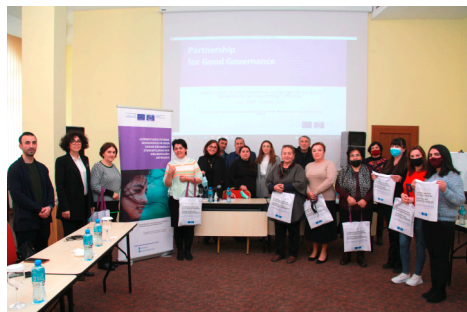
Workshop on Preventing and Combating Violence against Women and Domestic Violence (Shaki, 1 December 2021)

amend domestic laws and policies to better align national instruments with these standards. In 2020, the Council of Europe launched the project on “Raising Awareness on the Istanbul Convention and other Gender Equality Standards in Azerbaijan” as part of the EU/Council of Europe Partnership for Good Governance and more than 50 000 people were reached through publications, the media, and social media campaigns. Furthermore, nearly 300 officials and representatives of civil society organisations were trained on the topic.