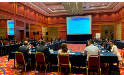
National workshop on Cybercrime Reporting (Assessment), Use of Cyber Taxonomies and Coordinated iOCTA reporting (Baku, 26-27 September 2022)