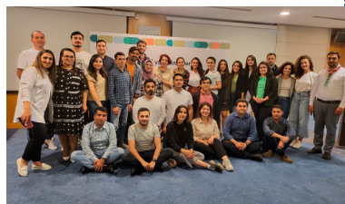
Seminar for trainers and youth workers involved in non-formal education in Azerbaijan (Baku, 28-30 September 2022)

Co-operation between the Council of Europe and the Ministry of Youth and Sport of the Republic of Azerbaijan is pursued under successive Action Plans. Youth activists and leaders living in remote areas of Azerbaijan were introduced to the Council of Europe's approaches and educational resources on youth participation and human rights education at regional training seminars, drawing on the expertise of an informal network of youth trainers created in 2017-2018. Azerbaijan participates in the Council of Europe Youth Co-operation programme, that provides training and capacity building for young people and youth organisations and facilitates their participation in decision making. A project on "Supporting the Development of the Participative and Rights-Based Youth Policies and Values-Based Youth Work" concentrates on promoting human rights education and access of young people to social rights, supporting non-formal education and development of network of young trainers and youth centres.