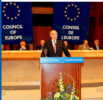
Address of the President of the Republic of Azerbaijan, H.E. Mr. Heydar Aliyev on the occasion of the accession of the Republic of Azerbaijan to the Council of Europe (Strasbourg, 25 January 2001)

The Republic of Azerbaijan became the 43rd member State of the Council of Europe on 25 January 2001. To date, the country has ratified 65 Council of Europe treaties (and signed seven more), most importantly the European Convention for the Protection of Human Rights and Fundamental Freedoms and its Protocols, European Social Charter, European Cultural Convention, conventions in the fields of the fight against terrorism, combatting money-laundering and corruption, protection of children against sexual abuse, prevention of torture, cybercrime, anti-doping, higher education, protection of national minorities, cross-border co-operation, sport and many others.