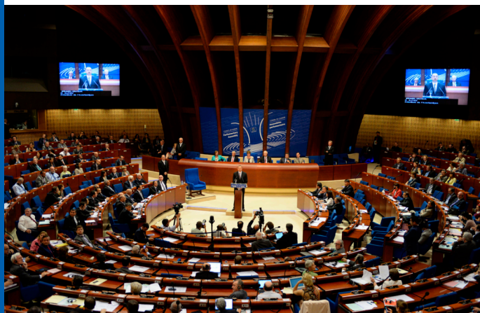
Address of the President of the Republic of Azerbaijan, H.E. Mr. Ilham Aliyev on the occasion of the Azerbaijan's Chairmanship of the Committee of Ministers of the Council of Europe (Strasbourg, June 2014)

Over the course of 20 years of membership, the Council of Europe and the Republic of Azerbaijan have developed technical co-operation programmes which are an integral part of the Organization's unique strategic triangle of standard-setting, monitoring and co-operation; meaning that the development of legally binding standards is linked to their monitoring by independent mechanisms and supplemented by technical co-operation to facilitate their implementation.