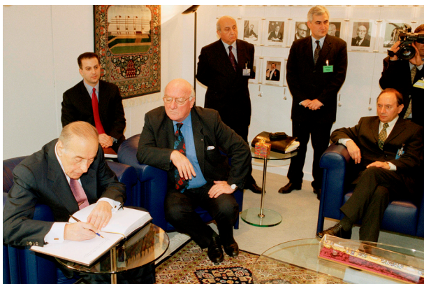
President of the Republic of Azerbaijan, H.E. Mr. Heydar Aliyev, signing the Golden Book of the Council of Europe (Strasbourg, January 2001)