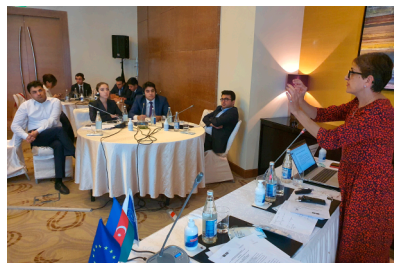
Workshop on Good practices in International Co-operation and Mutual Legal Assistance for Asset Recovery (Baku, 16-17 June 2022)

The co-operation takes into account the recommendations of the Groups of States against Corruption (GRECO) and the Committee of Experts on the Evaluation of Anti-Money Laundering Measures and the Financing of Terrorism (Moneyval) which conduct regular visits to Azerbaijan.