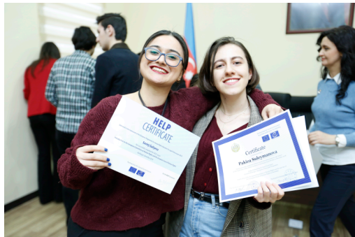
Certificate award ceremony at the Training of Trainers of the European Programme for Human Rights Education for Legal Professionals (HELP) (Baku, 20 February 2019)