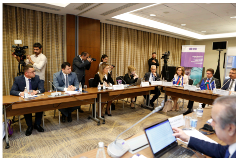
Event on the Role of National Parliaments in Preventing and Combating Violence against Women and Domestic Violence (Baku, 19 May 2022)