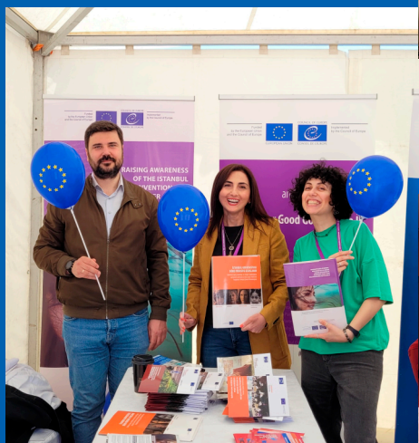
Promoting Council of Europe standards at the "EuroVillage 2022" (Baku, 14 May 2022)