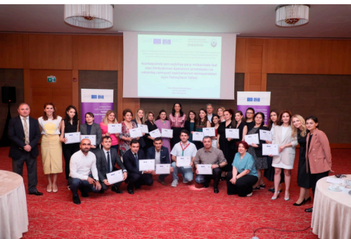
Training of Trainers on Combating Discrimination with participation of the Commissioner for Human Rights of the Republic of Azerbaijan (Ombudsperson), Ms. Sabina Aliyeva (Baku, 19-21 June 2022)