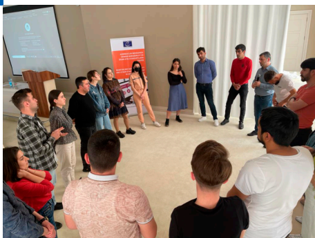
Training for regional social media activists on Mitigation of Hate Speech in the Media (Qabala, 9-10 April 2022)

Under the previous Action Plans, journalists and social media representatives from Baku and various regions of Azerbaijan were trained on gender equality and sensitive reporting as well as on ethical standards related to media coverage of elections, pandemics and gender-based violence cases. Additionally, lawyers, judges and prosecutors were trained in international legal standards on data protection and privacy, and access to information. After the successful completion of the project on “Reinforcing Gender Equality and other Ethical Standards in Azerbaijani Media” in June 2022, a new project on “Promoting Media Professionalism and Freedom of Information in Azerbaijan” is being implemented since July 2022.