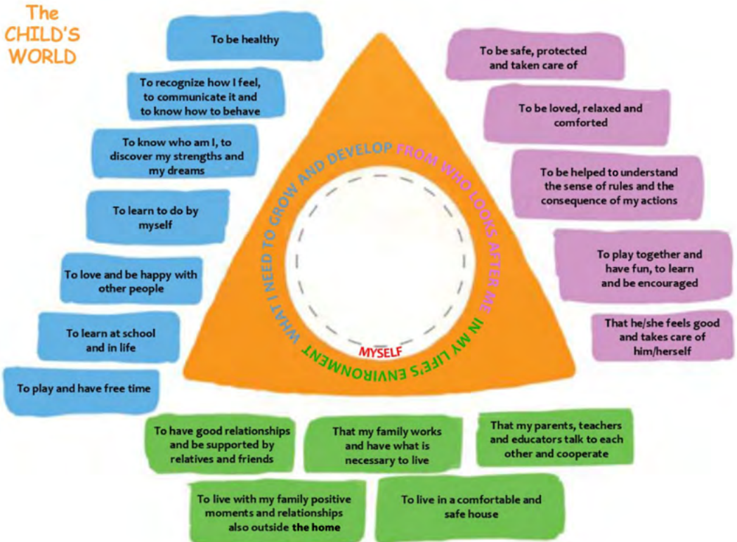
Figure 2. The Child's World Children's version

Figure 2 15 reproduces P.I.P.P.I.'s multidimensional model "The Child's World", at the centre of which one must imagine the child's picture. The Child's World has a "neutral version" (Milani et al. 2018: 31) and a version for the child – to be completed with him or her – and operators. Figure 2 presents the triangle that the operators use to work with children.