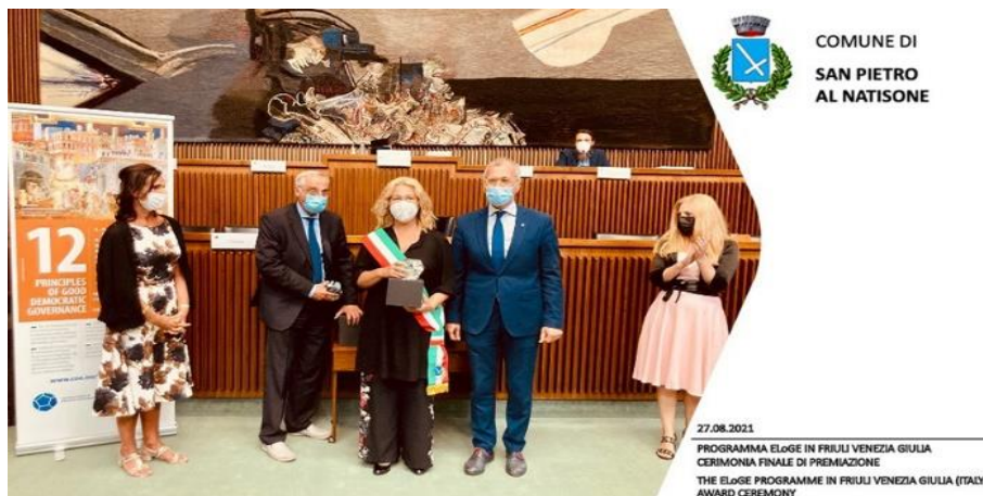
27.08.2021 PROGRAMMA ELoGE IN FRIULI VENEZIA GIULIA CERIMONIA FINALE DI PREMIAZIONE THE ELoGE PROGRAMME IN FRIULI VENEZIA GIULIA (ITALY) AWARD CEREMONY