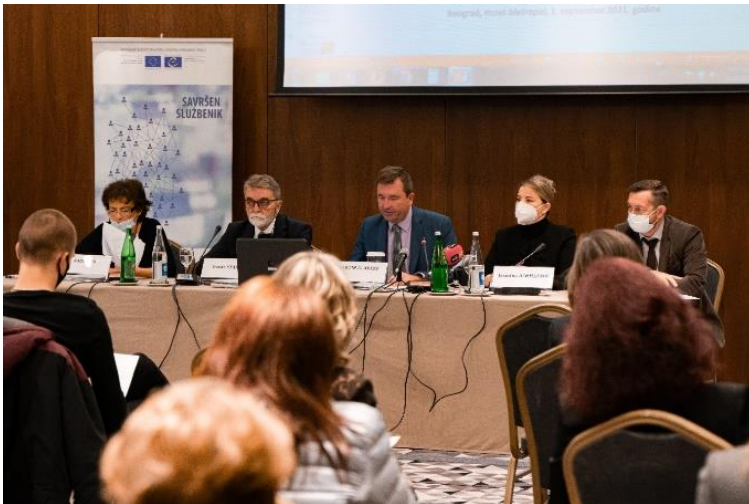
Conference on Overview of the Human Resource Management System in Local Self-Governments (21.9.2021, Hotel Metropol) participation of DEU, SCTM, MPALSG, Council of Europe, and LSG representatives.

In 2021, the Council of Europe continued to be the main partner of the Serbian government and the Ministry of Public Administration and Local Self-government in the implementation of the public administration reform at the local level in the Republic of Serbia, through the Programme “Human Resource Management in Local Self-Government – Phase 2” .