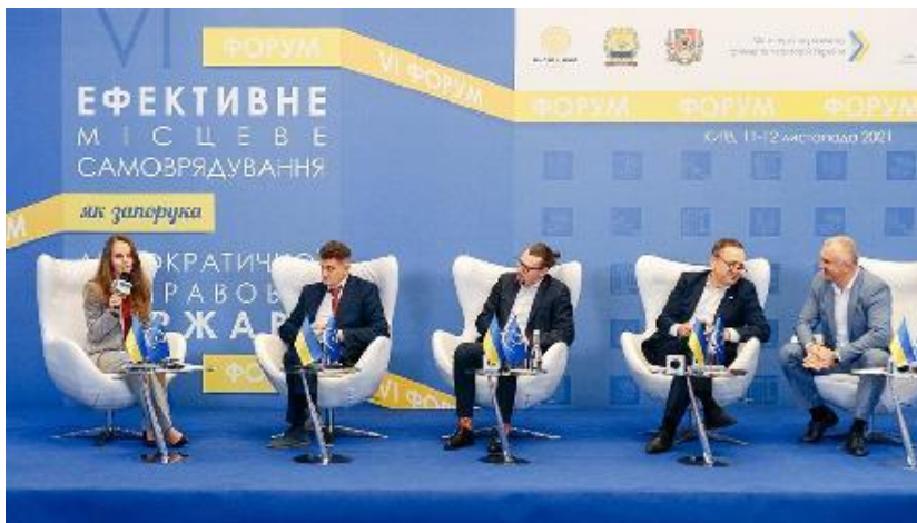
Local Self-Government Forum in Ukraine: a key annual event

The Centre of Expertise continued the 27-months project “ Enhancing decentralisation and public administration reform in Ukraine ” scheduled to run until 31 December 2021, with a total budget of €1.560.000.