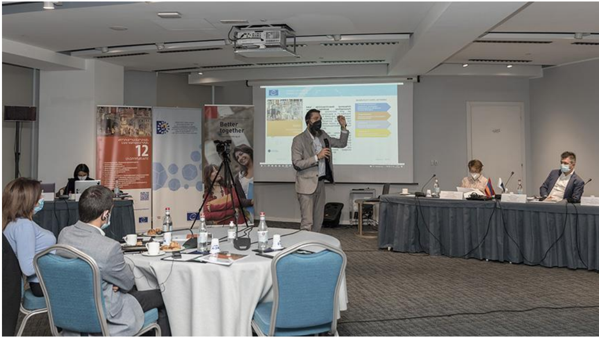
A ReBuS workshop in Armenia: the municipalities prepare the Resilience Building Strategies