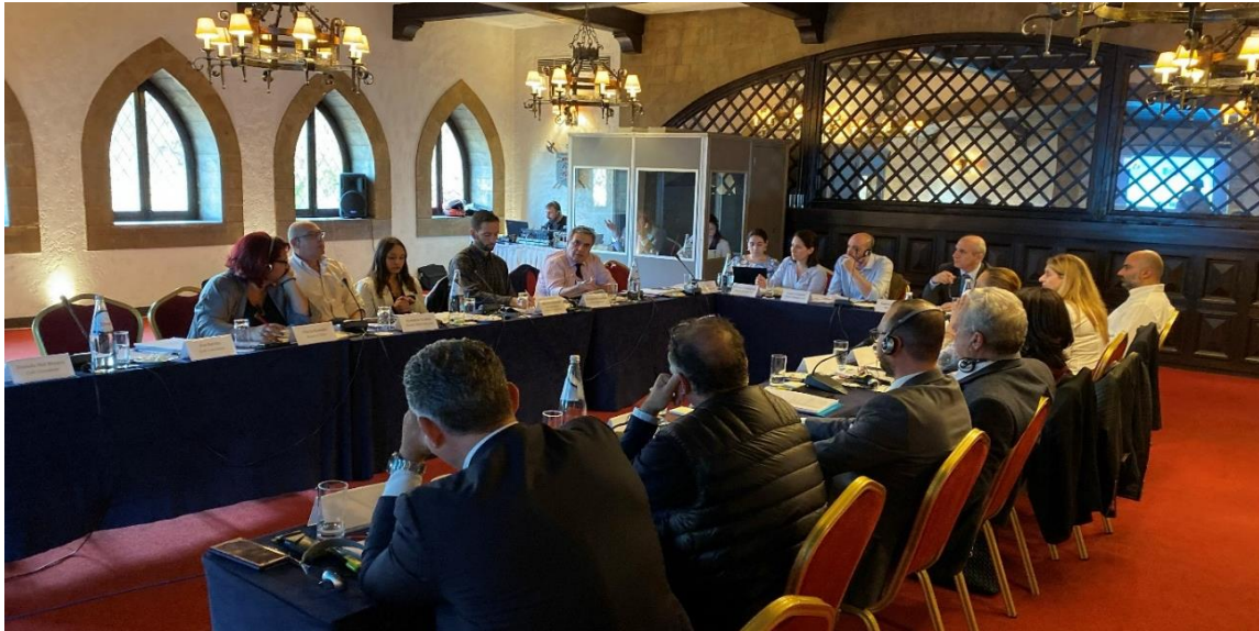
Workshop on Inter-Municipal Cooperation in Athens

Taking stock of these experiences, a Handbook on IMC for Greece was developed and disseminated to all Greek municipalities and relevant stakeholders. The Handbook provides user-friendly guidance on IMC, thus contributing to the sustainability of the project. It was presented through a webinar held in February 2021, and published in a dedicated section of the website of the Ministry of Interior, accompanied by explanatory videos.