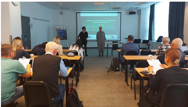
A workshop for local authorities in Lithuania

A new project " Establishment of legal, institutional and financial framework at regional (county) level, capacity-building to enhance quality of regional public administration in Lithuania ", co-funded by the Council of Europe and the European Union, was launched in February 2021. It aims to support the Lithuanian government with advice on the institutional set up and performance of the Lithuanian regions, including on specific topics such as: programming and planning process, fiscal decentralisation, territorial and regional development strategies. The project also aims to strengthen the capacities of the local and newly established regional authorities on strategic regional and municipal planning, local finance and human resources management.