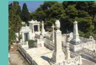
Andros, Municipal Cemetery of Chora