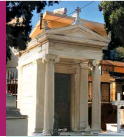
Chios, Municipal Cemetery

Dr Lina Mendoni Minister of Culture and Sports