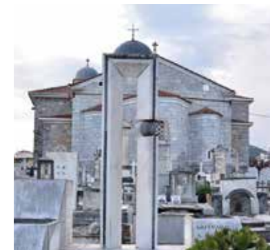
Kefalonia, Argostoli Cemetery