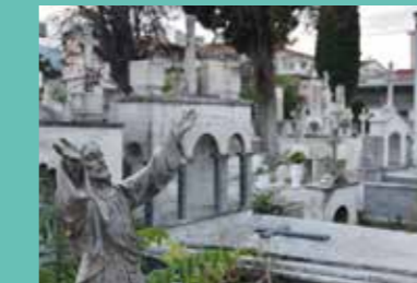
Volos, Taxiarches Cemetery