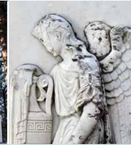
Skiathos, Municipal Cemetery