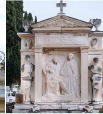
Nafplion, Municipal Cemetery