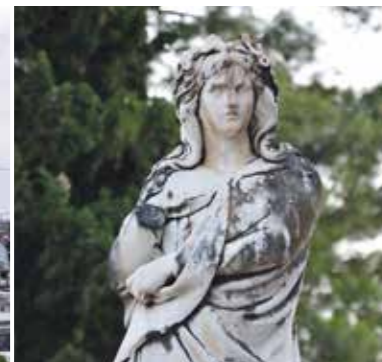
South Kynouria, All Saints Cemetery