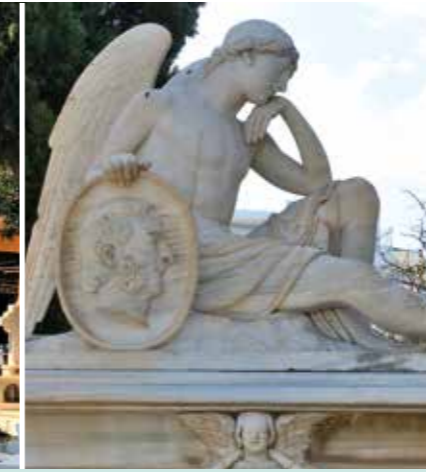
Syros, Hermoupolis Cemetery