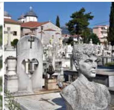
Kifissia, Municipal Cemetery