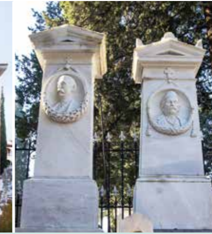
Ioannina, St Nikolaos Kopanon Cemetery