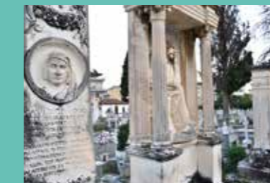
Tripoli, Metamorphosis Cemetery