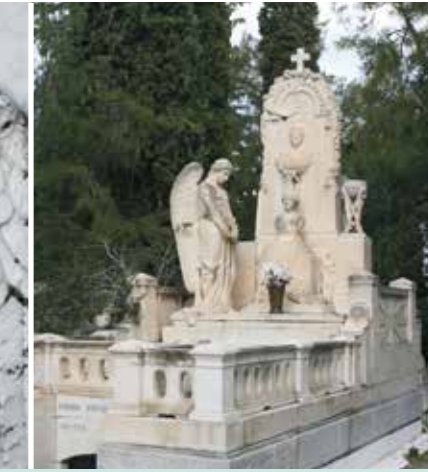
Piraeus, Cemetery of Anastasis