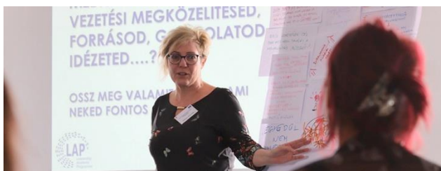
Leadership Academy Programme session, European Youth Centre Budapest, April 2023.

Capacity building: The Leadership Academy Programme (LAP) is a cutting-edge training series customised to the needs of municipal leaders in Hungary, and tested in a Training-of-Trainers with Hungarian experts. In 2023, it offered the opportunity for in-depth