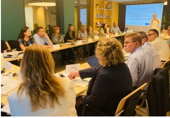
Roundtable discussion organised by CPF during the Peer Review Visit