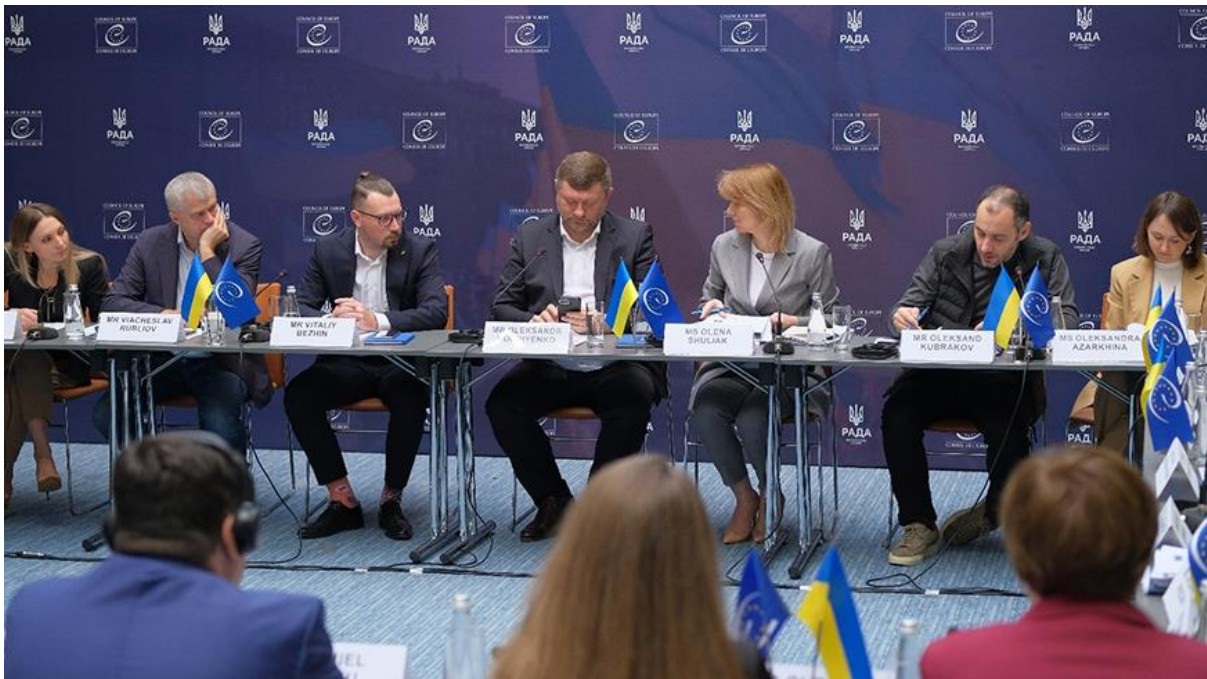
High-Level Dialogue in Ukraine: Decentralisation and Transition to Civilian Regime