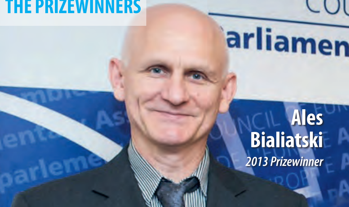
Ales Bialiatski 2013 Prizewinner

O n 30 September 2013, the Prize was awarded to human rights activist Ales Bialiatski (Belarus).