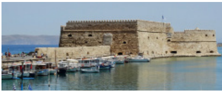
Port of Kastelli