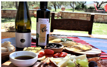
Traditional meal at the VIOLEA olive mill