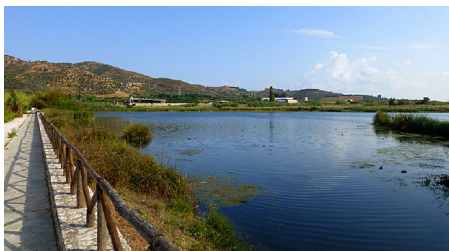
The birdwatchers' lake Agia Lake