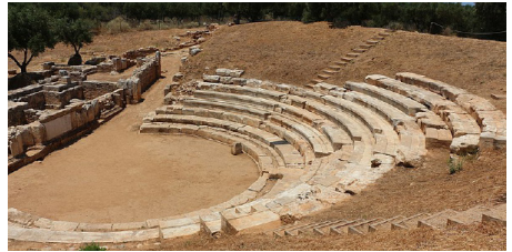
Aphiteater at Aptera