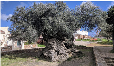
Olive tree of Vouves