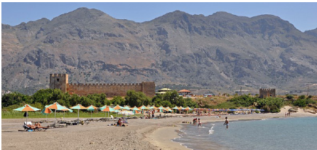
Frangokastello Beach