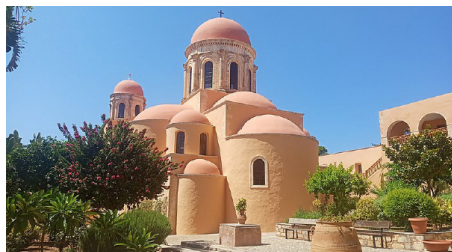
Chrisopigi Monastery

There is a small Monastery-Shop where Monks offering their organic olive oil and wine. The olive oil of the Monastery Agia Triada has won many awards.