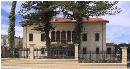
Eleftherios Venizelos Museum House of Chalepa