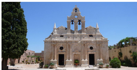
Arkadi Monastery Church