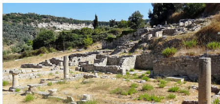
Eleftherna © Olaf Tausch