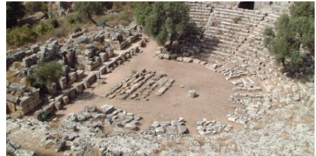
KaunosTheatre, ancient city of Aptera

► Visit of the ancient city of Aptera, one of the most interesting archaeological sites in western Crete. Aptera was inhabited since Minoan times but it only became a significant city around the 8th century BC. Its location above the bay of Souda was also strategically important: close to its two seaports Minoa (today's Marathi) and Kasteli (near Kalyves). Aptera could control the circulation of ships and it became a very important trading post in Crete and one of the greatest cities on the island. Walk duration About 45 min.