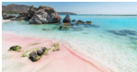
Elafonisi Pink sand Beach