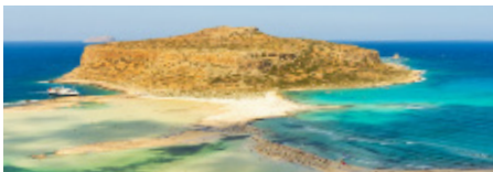
Gramvousa Balos