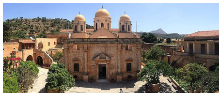
Agia Triada Monastery, Crete

► Visit of the Monastery Agia Triada at Akrotiri peninsula near the Savros village, a location planted with olive groves, vineyards and cypress trees. Architecturally, it is one of the most significant examples of the Cretane Renaissance. It was funded by brothers Jeremiah and Lorenzo of the old Venetian family. The Holy Trinity (Agia Triada) Monastery is probably the most impressive monastic complex of the final period of Venetian rule on Crete, due to both its scale and architectural form.