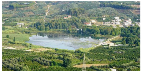
Agia Lake