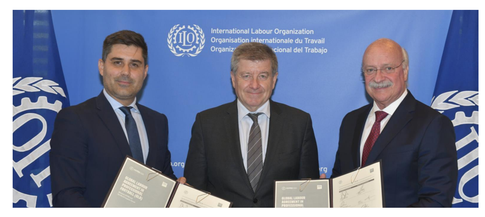
Player Voice: Collective Bargaining & Social Partner Rights as the most effective form of Governance