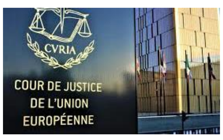
European Court of Justice