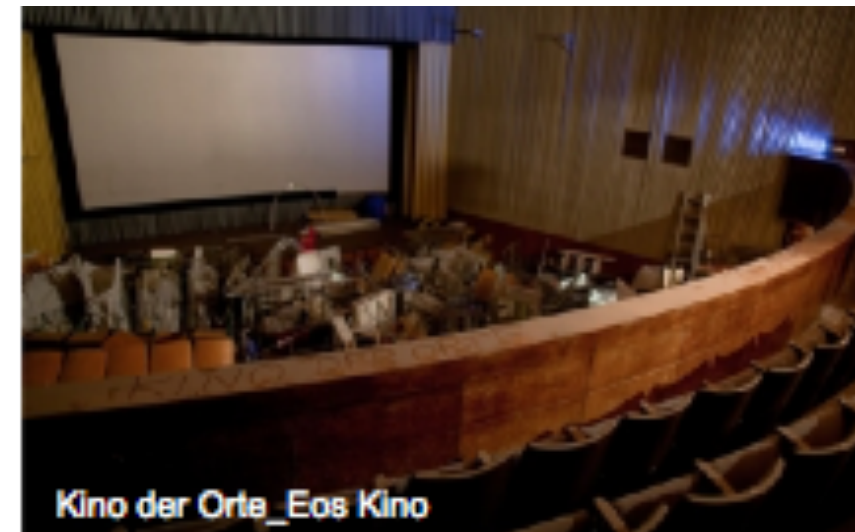
Kino der Orte_Eos Kino