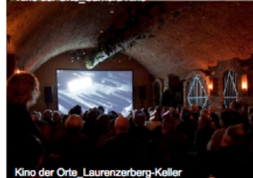
Kino der Orte_Laurenzerberg-Keller