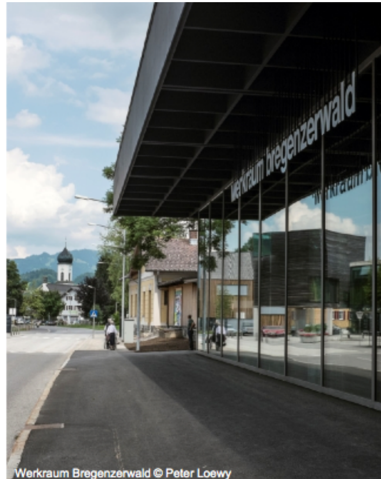
Werkraum Bregenzerwald