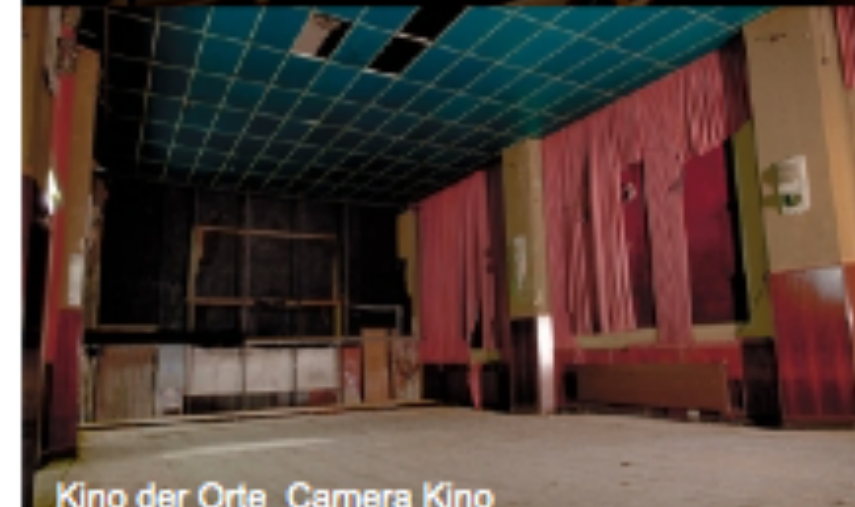
Kino der Orte_Camera Kino