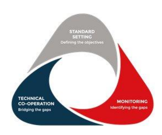
Figure 1: Council of Europe strategic triangle