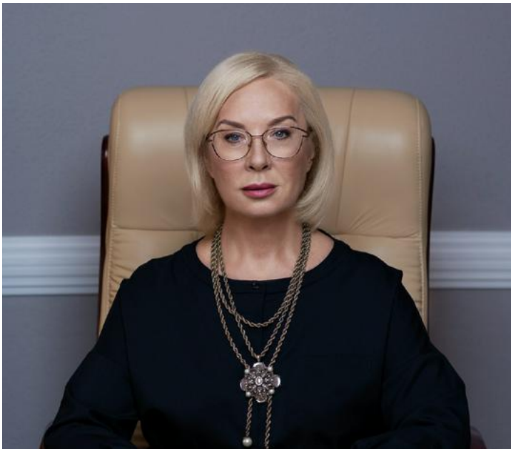
LIUDMYLA DENISOVA, Ukrainian Parliament Commissioner for Human Rights