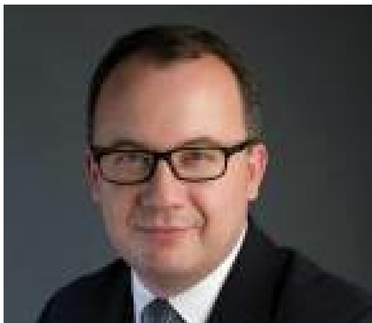
ADAM BODNAR, Commissioner for Human Rights Poland