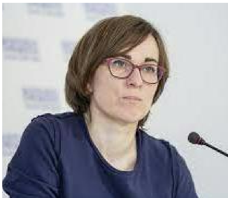
BIRUTE SABATAUSKAITE, Equal Opportunities Ombudswoman of Lithuania

The network of “equality bodies” is extremely important. There are about 2,500 Roma living in Lithuania and being Lithuanian citizens. The housing situation has improved considerably: 90% live below the poverty line, and 67% live in extremely poor conditions. Roma have a large number of problems, including disability. According to the survey, other people do not want to live and work having Roma around. Although special measures are needed, it is very important that any programme treats Roma as part of society, not separate from it. The pandemic affects those who do not have access to social and health services. Lithuania does not yet have a National Action Plan for Roma Integration but is in direct contact with Roma communities. During the quarantine, Roma have completely lost access to many services. The Roma Strategy, therefore, should be developed in close cooperation with Roma communities and constantly monitored.