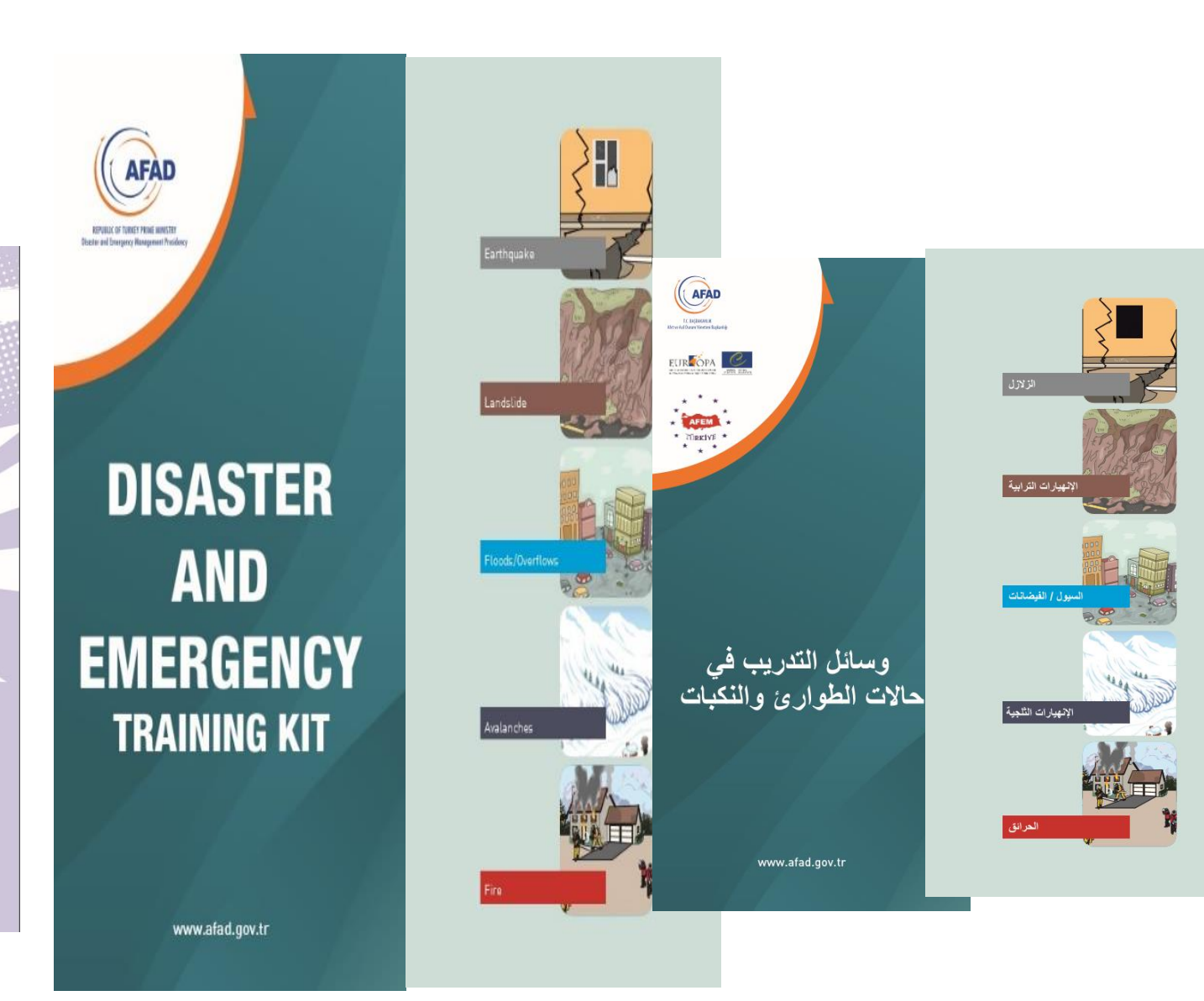
Figure. Training kit for adults

their response capabilities in an emergency situation and will be provided for volunteer trainers to