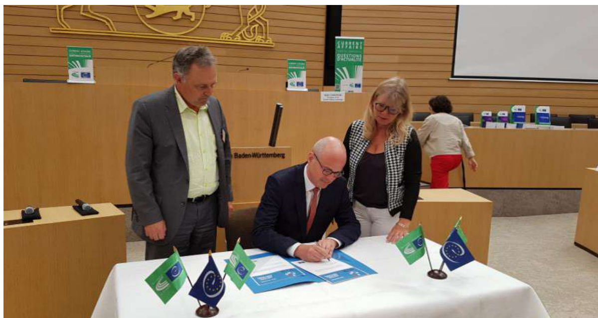
Signature of the Pact of Cities and Regions to stop sexual violence against children by the Baden-Württemberg County Association in Stuttgart, 28 June 2019

It initiates debates and projects on these topics and contributes actively to the work done in this connection within the Council of Europe and at the European level.