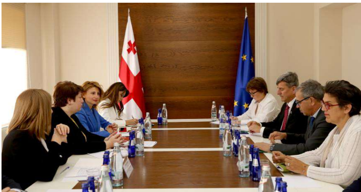
Meeting between the Georgian authorities and a Congress delegation in Tbilisi, 23 September 2019