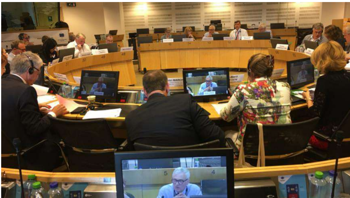
Meeting of the Bureau of the Congress in Brussels, 26 June 2019