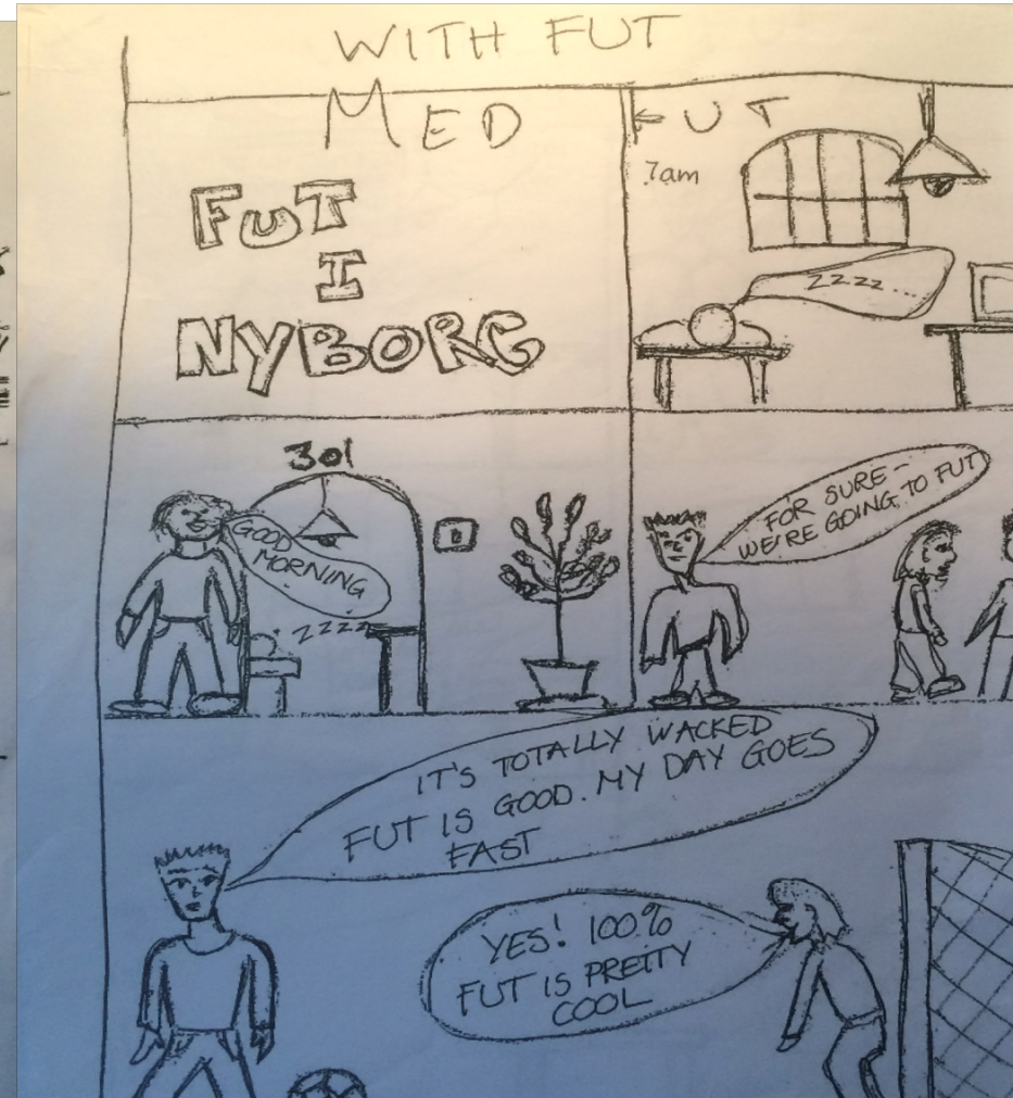
Cartoon drawn by an inmate at Nyborg State Prison during the project