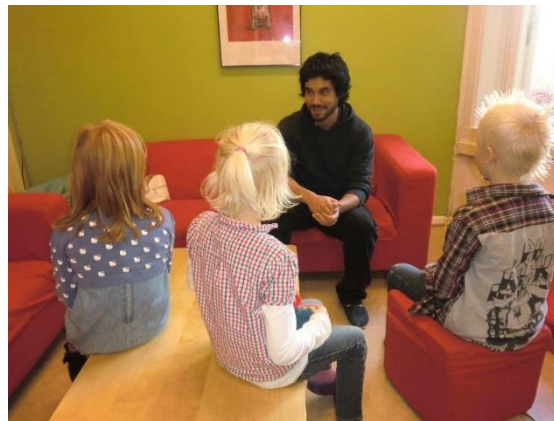
Listening to their perspectives, wishes and needs