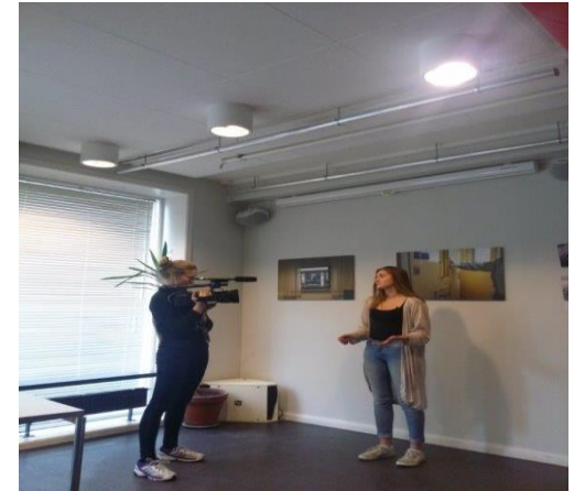
Interviews on television