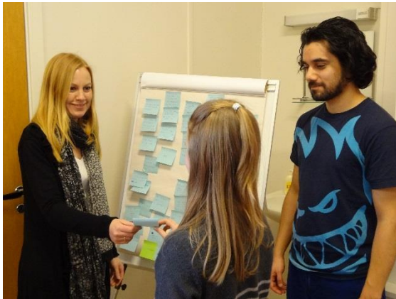
Getting their views on new regulations and law proposals