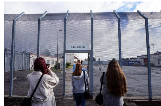
Joining them behind the walls with cameras