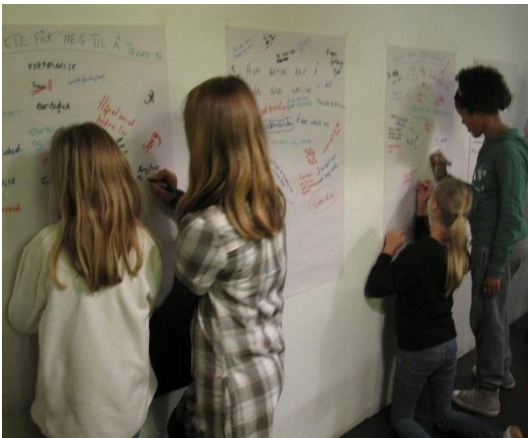
Preparing for children's hearing with UN CRC representative