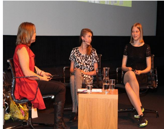
Sharing experience and views at a conference