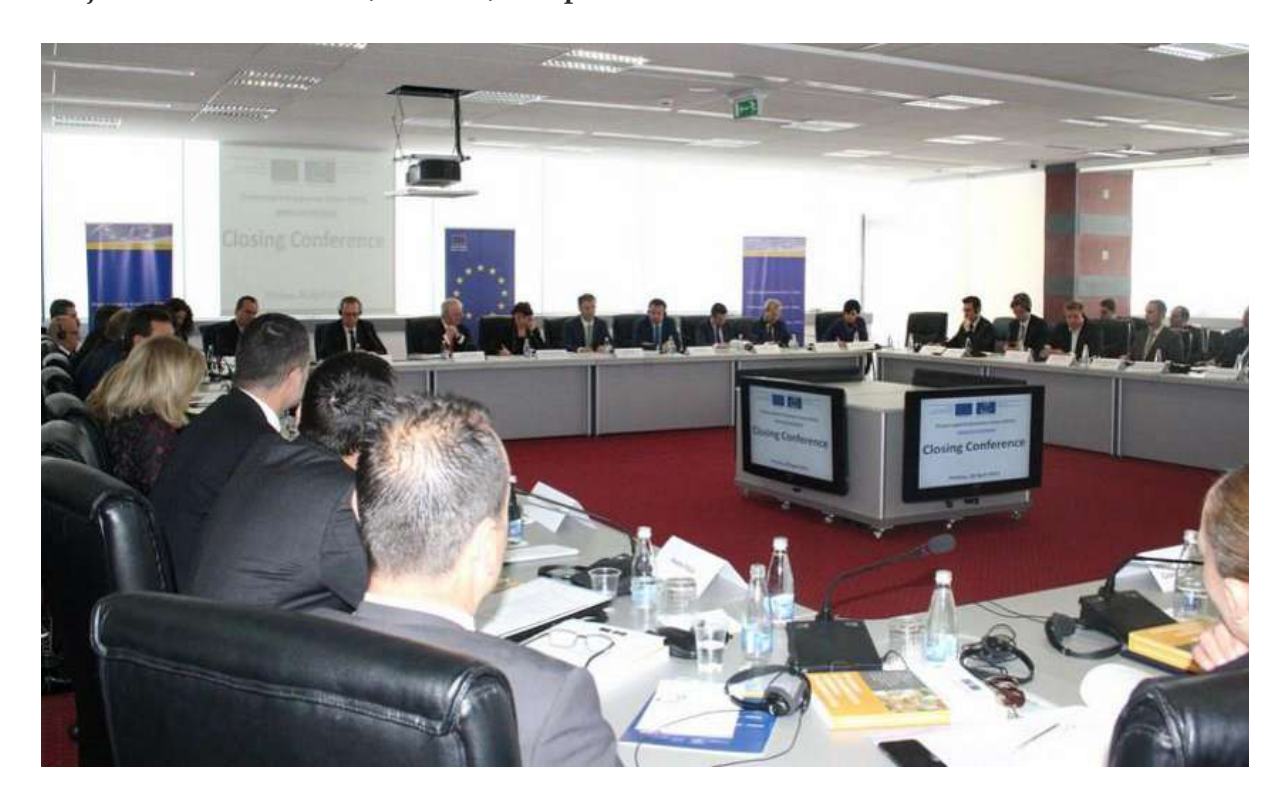
Project Final Conference, Pristina, 28 April 2015