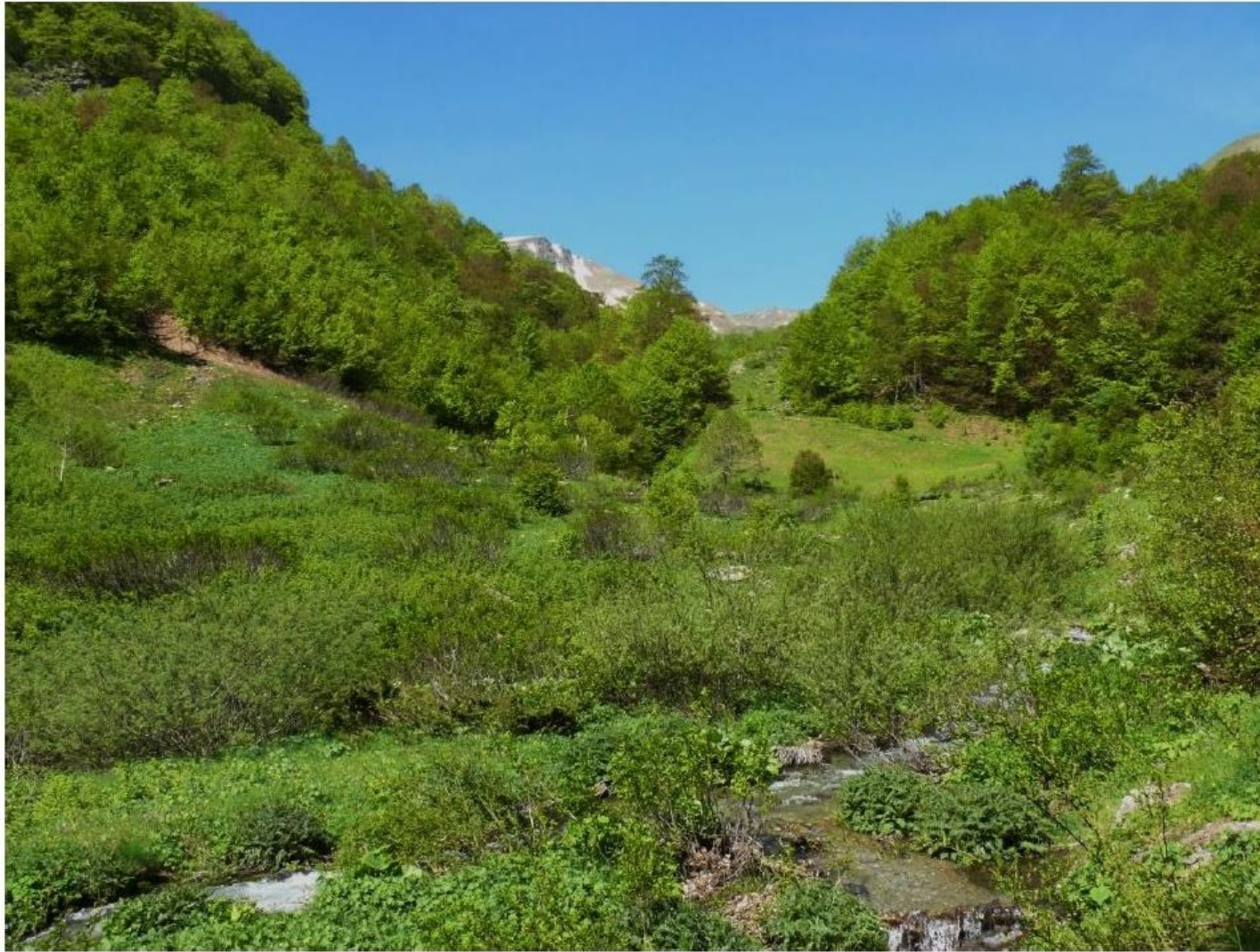
Figure 3010: Zhirovnichka Reka I 200 m above the projected intake point of HPP Zhirovnichka Reka II. This part belongs to the proposed zone for strict protection inside Mavrovo NP.