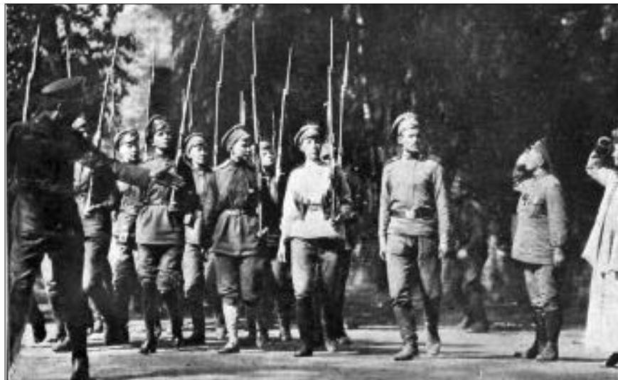
Russian female recruits on passing-out parade. These are members of the Women's Battalion of Death.