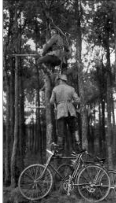
German bicycle scouts keeping watch in a tree