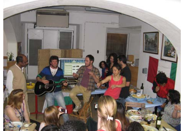
Photo 14 a, b Drumming workshop and European youth exchange spontaneous concert

Whenever they take a workshop out to communes or community centres around Lisbon, it is very popular with young Portuguese but it also attracts young people from African communities who have only vague knowledge of African drums but