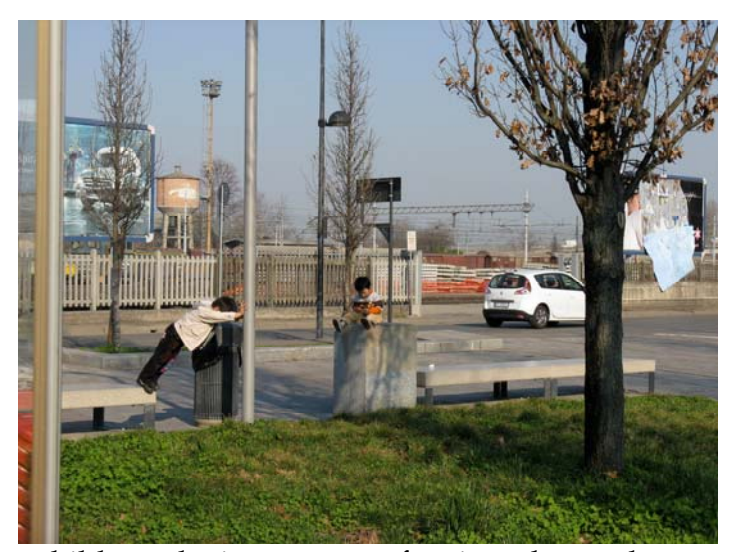
Photo 1 Chinese children playing on street furniture by road next to Piazza Secchi

and to replace it with a new public square – Piazza Secchi with a non-alcoholic bar.<sup>33</sup> As part of the participatory approach, 'planning for real' methodology was used, working with adolescents from Spazioraga – (Space for Children) an organisation for young people at risk - to design the layout, trees, benches, kiosk and other street furniture in conjunction with the architects. Yet despite the involvement in the planning and layout of the square, it is devoid of a children's play area and green and so children improvise by climbing on the concrete walls, bollards and benches. (See photo 1.)