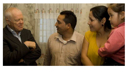
Commissioner's visit to Spain, Roma settlement in Madrid

several settlements and neighbourhoods where Roma encounter harsh living conditions (see below, "Reports").