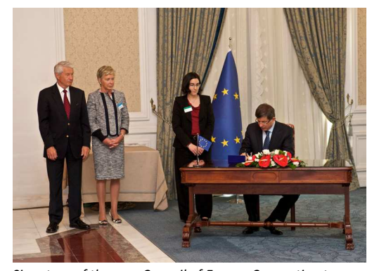
Signature of the new Council of Europe Convention to prevent and combat violence against women by Mr Ahmet Davutoğlu Minister for Foreign Affairs, Turkey

gathering Ministers of Foreign Affairs from 47 member states.