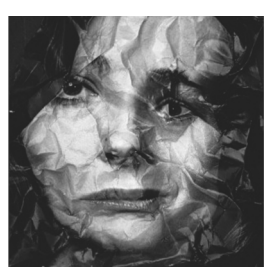
"It starts with screams but must never end in silence." Image and slogan used in the Council of Europe's anti-violence campaign.

Council of Europe, to the non-member States which have participated in the elaboration of this Convention, to the European Union and to any State invited to accede to this Convention.