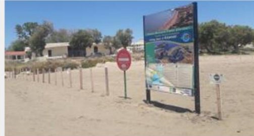
Photo 12. Implementation of management measures at Kalamaki nesting beach (i.e. signs and polls) for the information of the visitors.