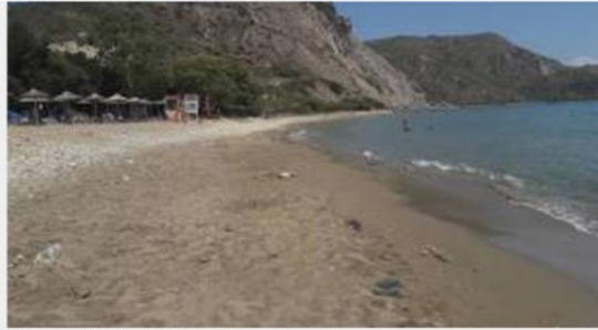
Photo 2. Dafni Nesting Beach