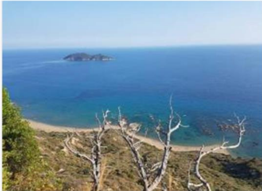
Photo 1. Sekania Nesting Beach