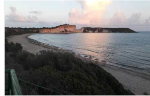
Photo 5. Gerakas Nesting Beach