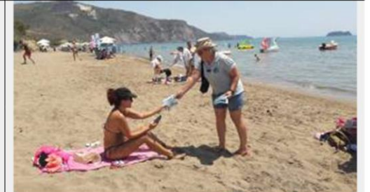
Photo 8. Terrestrial Park Rangers from the M.A. of the N.M.P.Z. informing visitors for the regulation measures in the nesting beach of Kalamaki