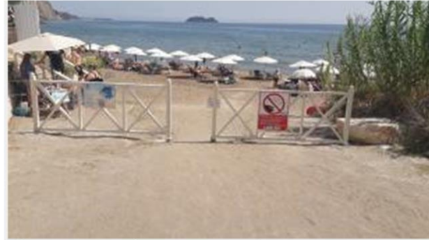
Photo 15. Implementation of management measures on the nesting beach of Kalamaki regarding the ban on entering the beach during the night and the ban of enter motor vehicles all the year with the installation of new barrier bars during 2022.