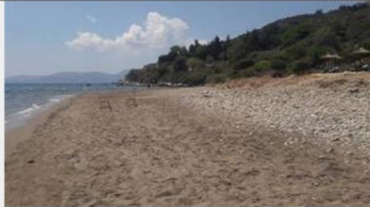
Photo 4. Protection cages on nests in the nesting beach of Dafni