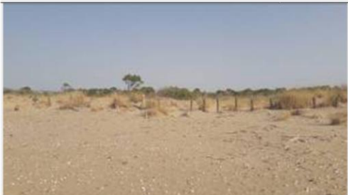
Photo 13. Implementation of management measures on the nesting beach of Kalamaki regarding the prohibition of approaching vehicles, horses, etc at the beach.