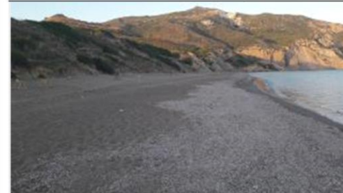
Photo 9. Protection cages on nests and delineation of the acceptable upper limit in the nesting beach of Kalamaki.