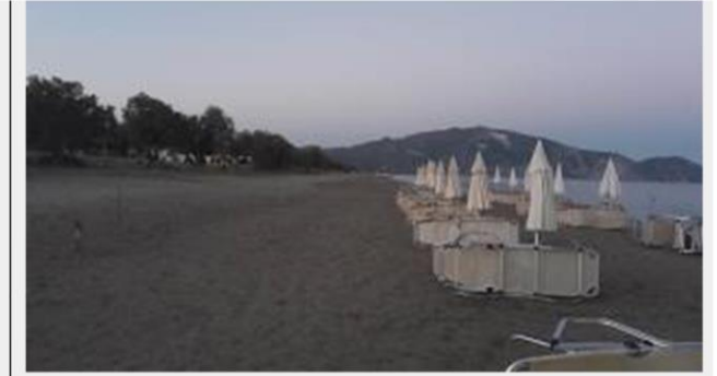
Photo 16. Nesting beach of Kalamaki beach during the night

Photos captured during summer periods 2021-2022 and provided by courtesy of the PAMU 11/NECCA