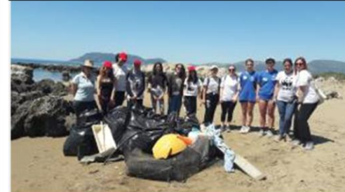
Photo 7. Nesting beachcleaning by the Eco Guards from the M.U. of Zakynthos in collaboration with NGO WWF, Archelon and Ionian University