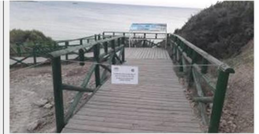
Photo 6. Implementation of management measures on the nesting beach of Gerakas regarding the ban on entering the beach during the night