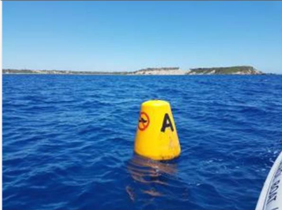
Photo 3. Buoys immersion that prohibit the access in the maritime zone A (summer months)