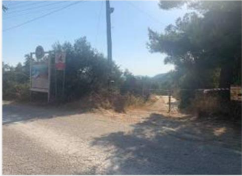
Photo 11. Implementation of management measures on the nesting beach of Sekania regarding the prohibition of approaching visitors to the beach