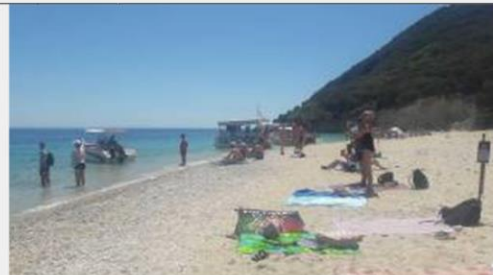
Photo 14. Delineation of the acceptable upper limit of beach visitors presence on the nesting beach of Marathonisi as a management measure for nest protection.