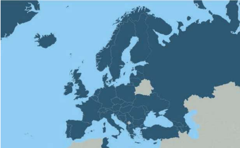
■ State Parties to the Lanzarote Convention