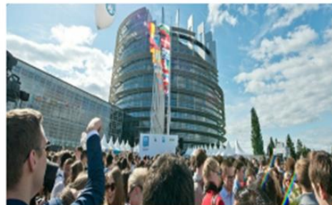
Access to rights CM/Rec(2016)7