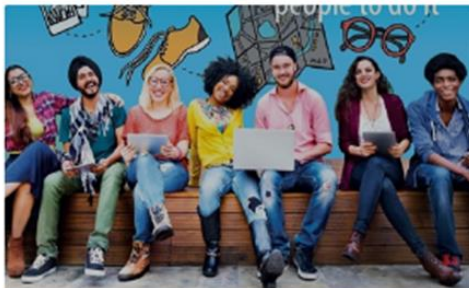
Youth work CM/Rec(2017)4