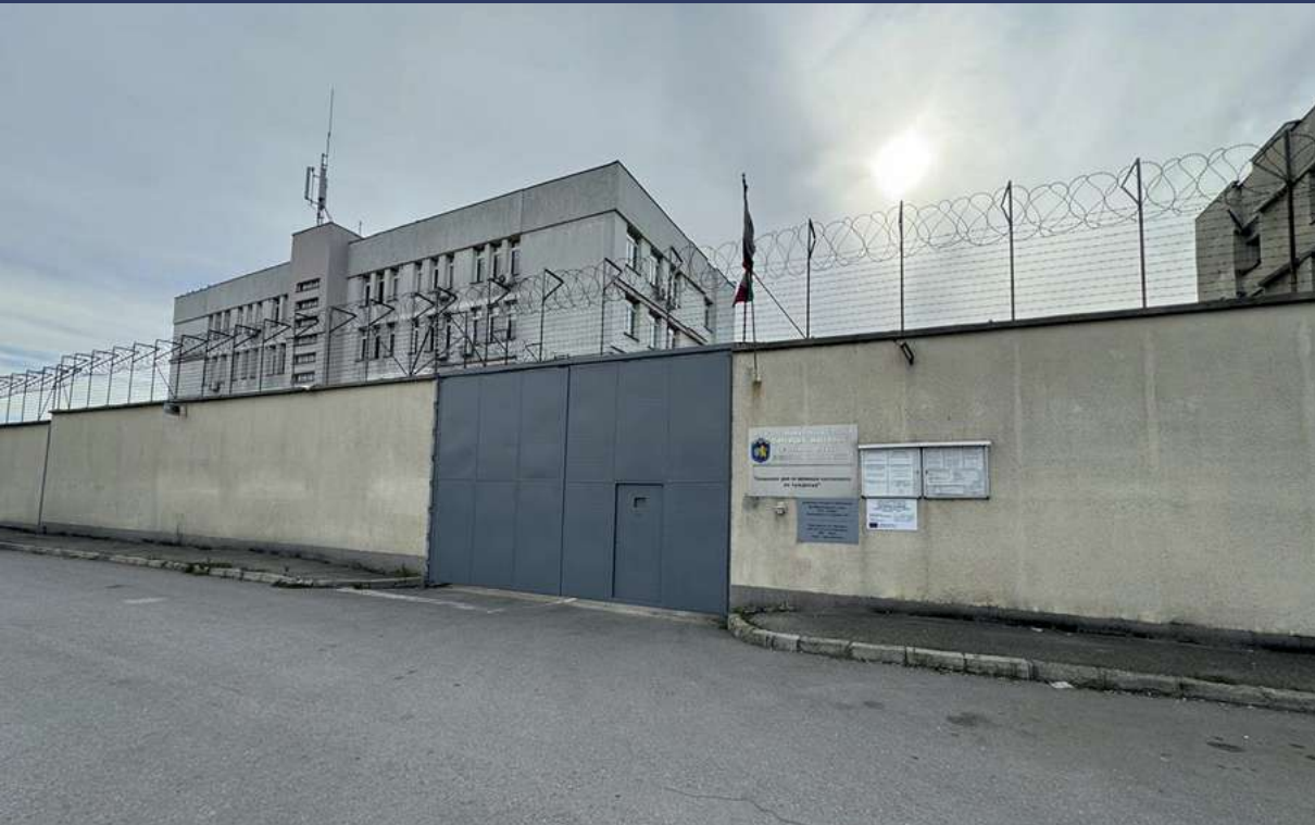
Special Home for the Accommodation of Foreigners (SHTAF), Busmantsi