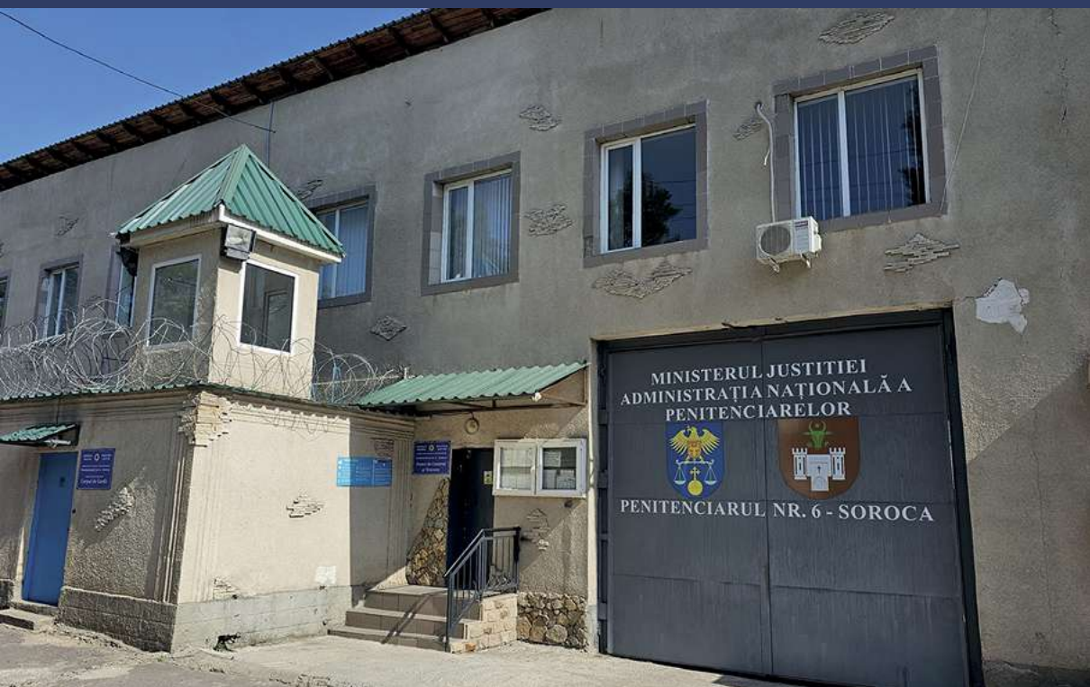
Prison no. 6 in Soroca