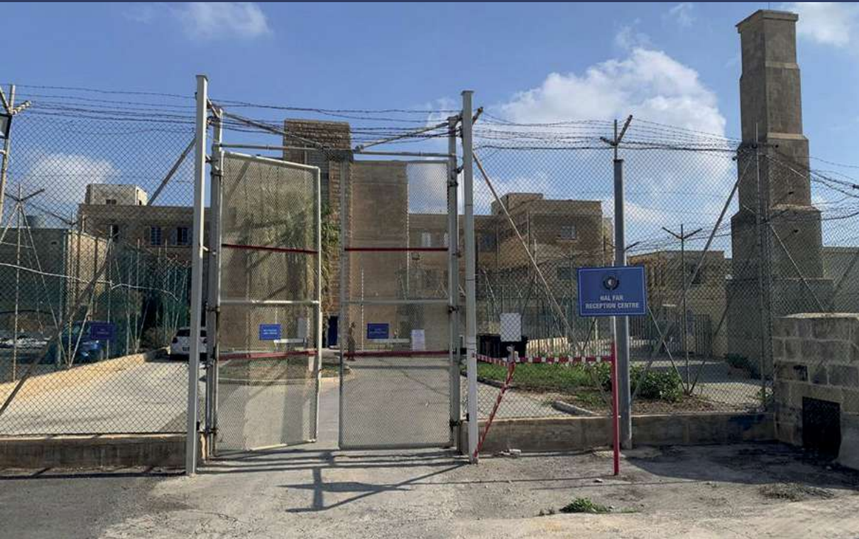
Hal Far Reception Centre