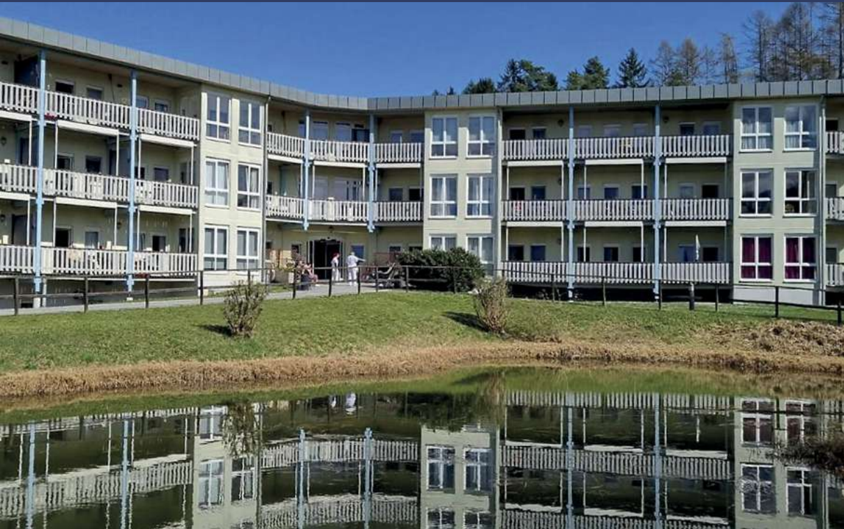
Sanlas Holding Margarethenhof Home in Voitsberg