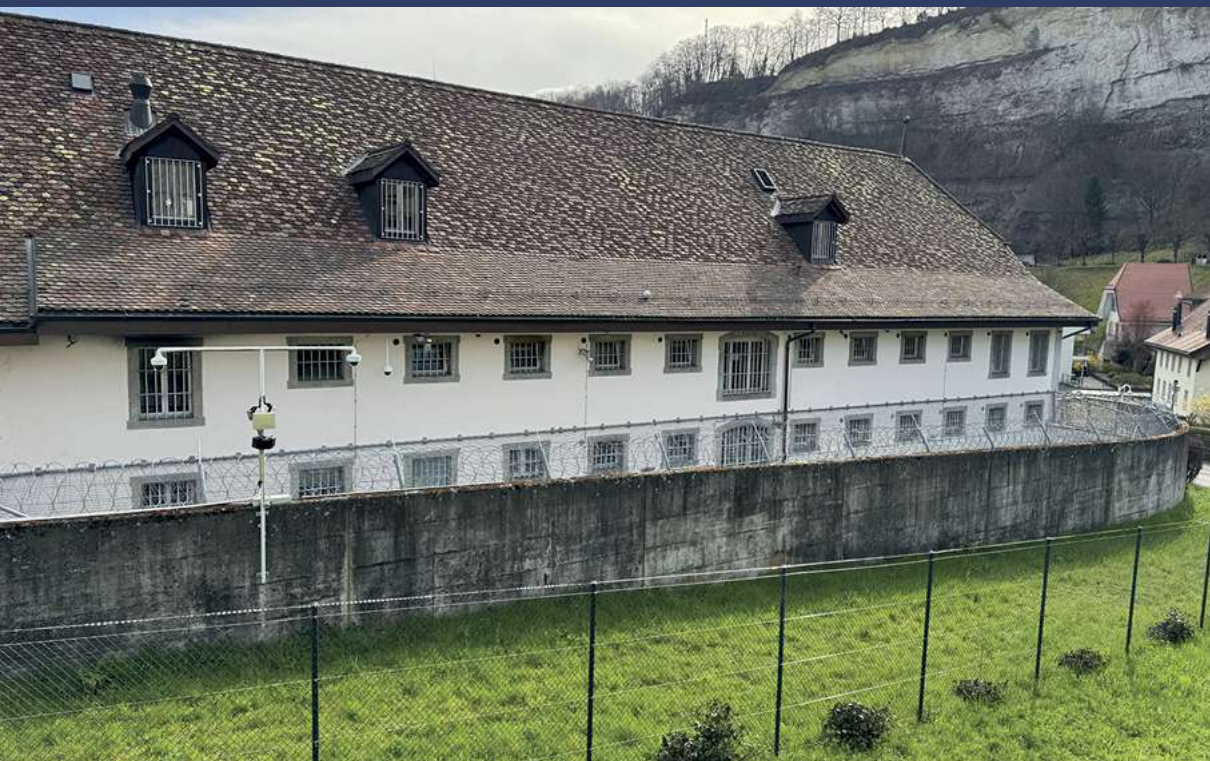
Central Prison, Fribourg