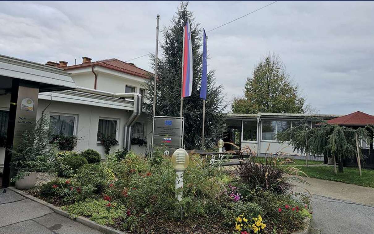
Lukavci Special Social Welfare Establishment