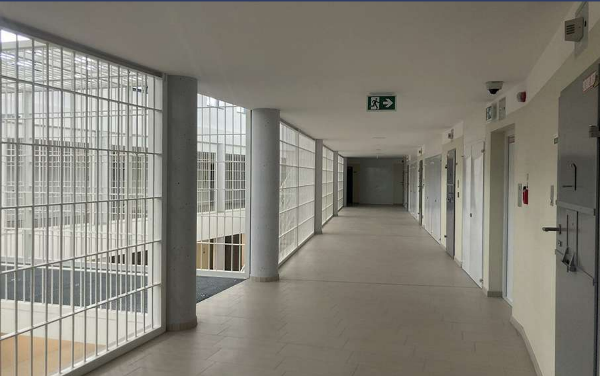
Hronovce Detention Institute