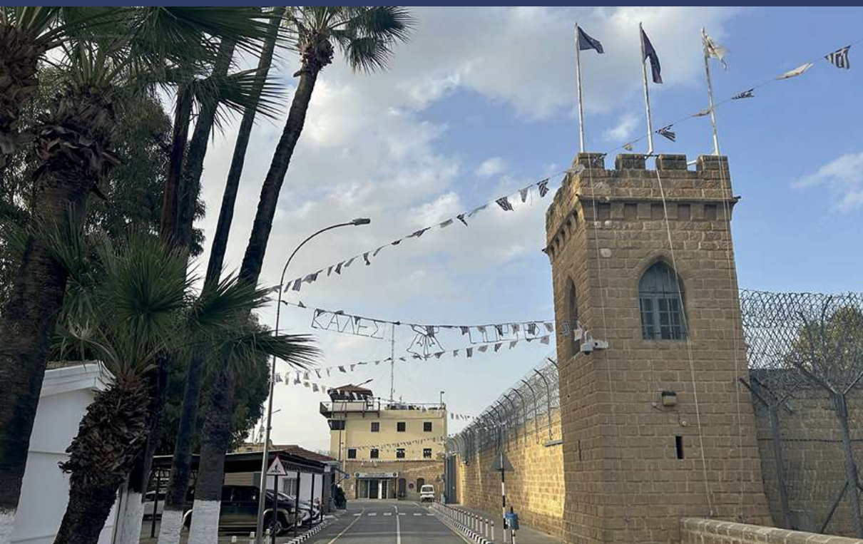
Nicosia Central Prisons