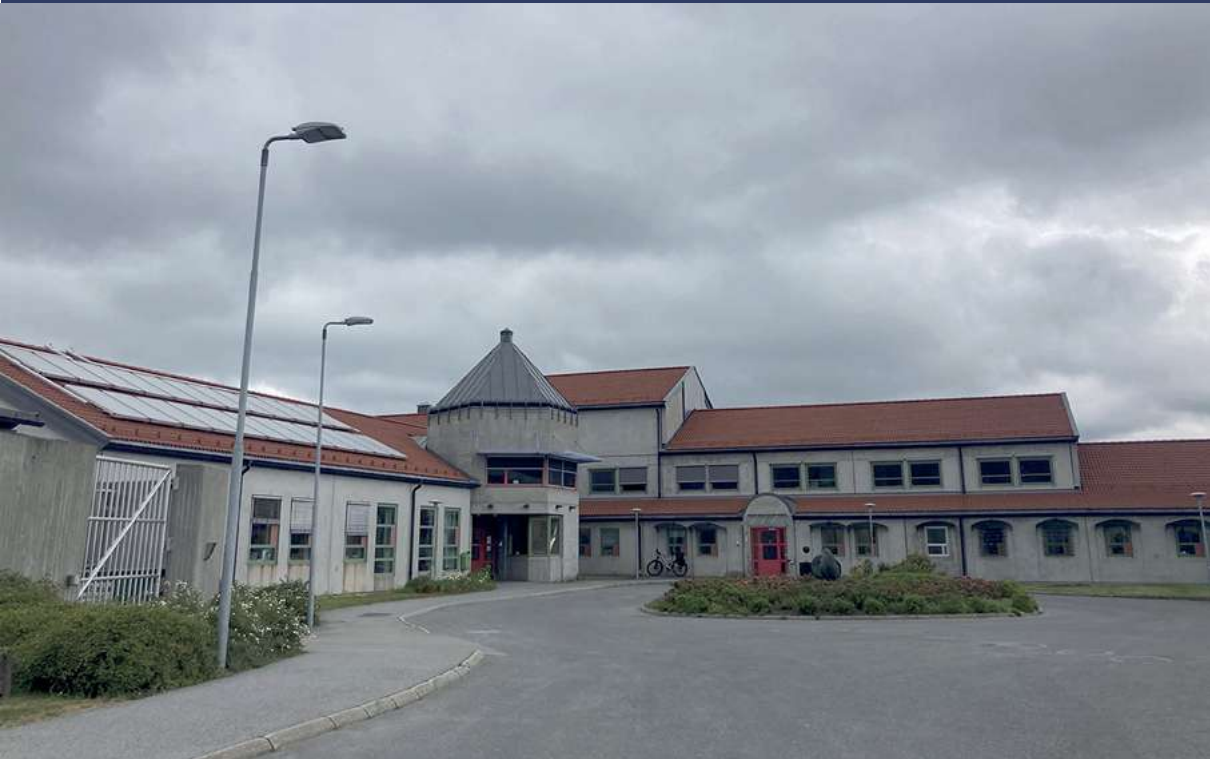
Skien Unit of Telemark Prison