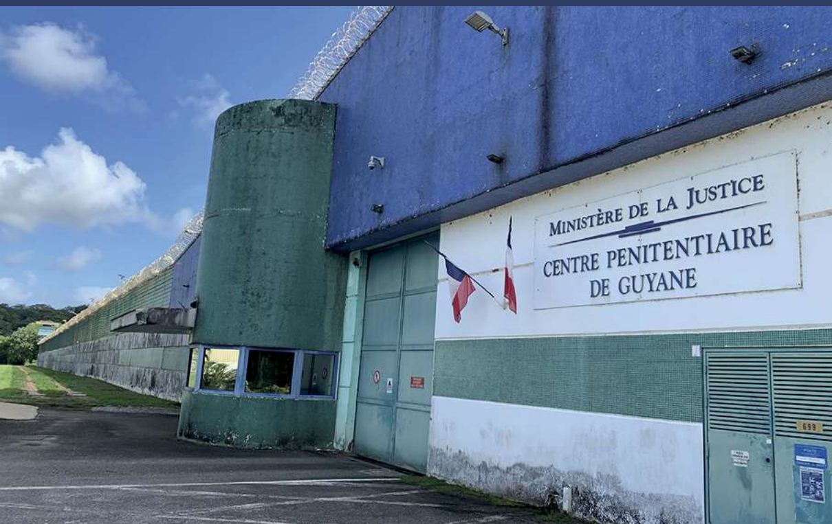
Rémire-Montjoly Prison, French Guiana