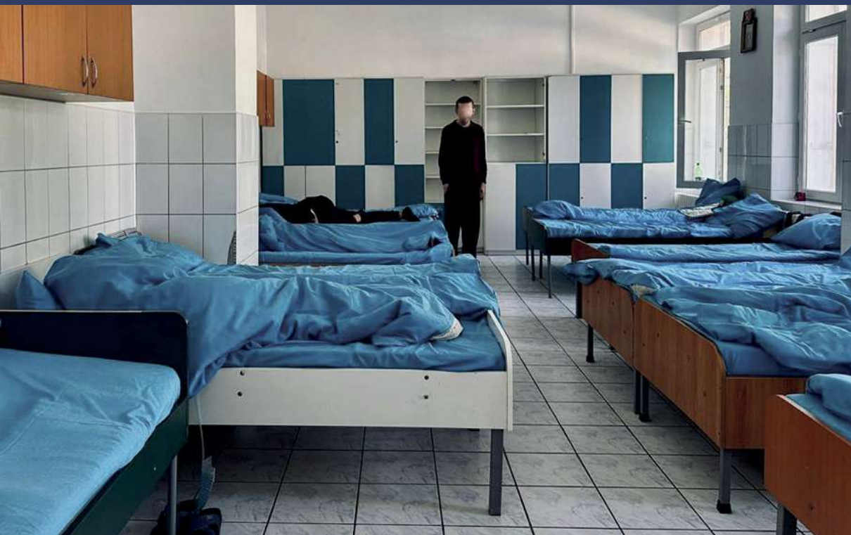
Pădureni-Grajduri Psychiatric and Safety Measures Hospital