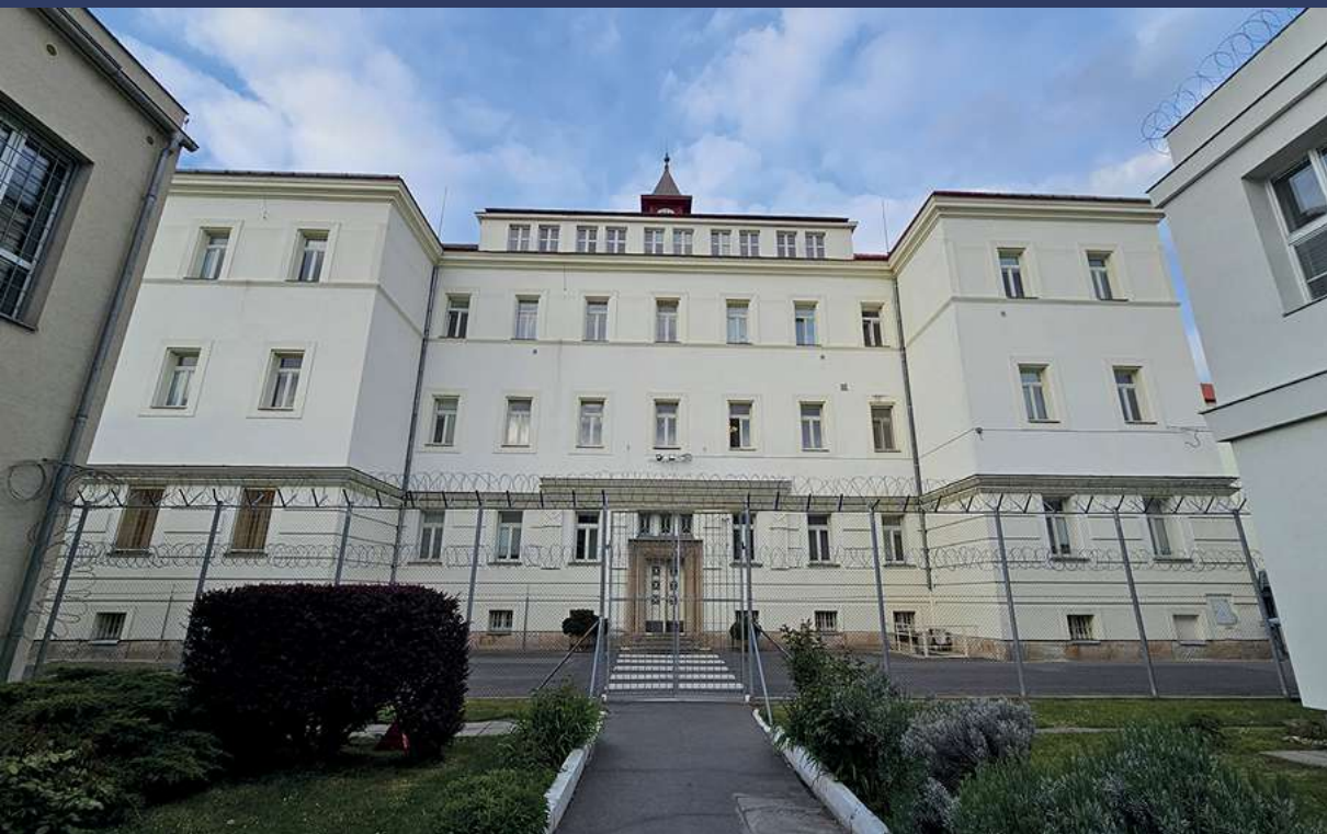
Pankrác Remand Prison and Security Detention Facility, Prague