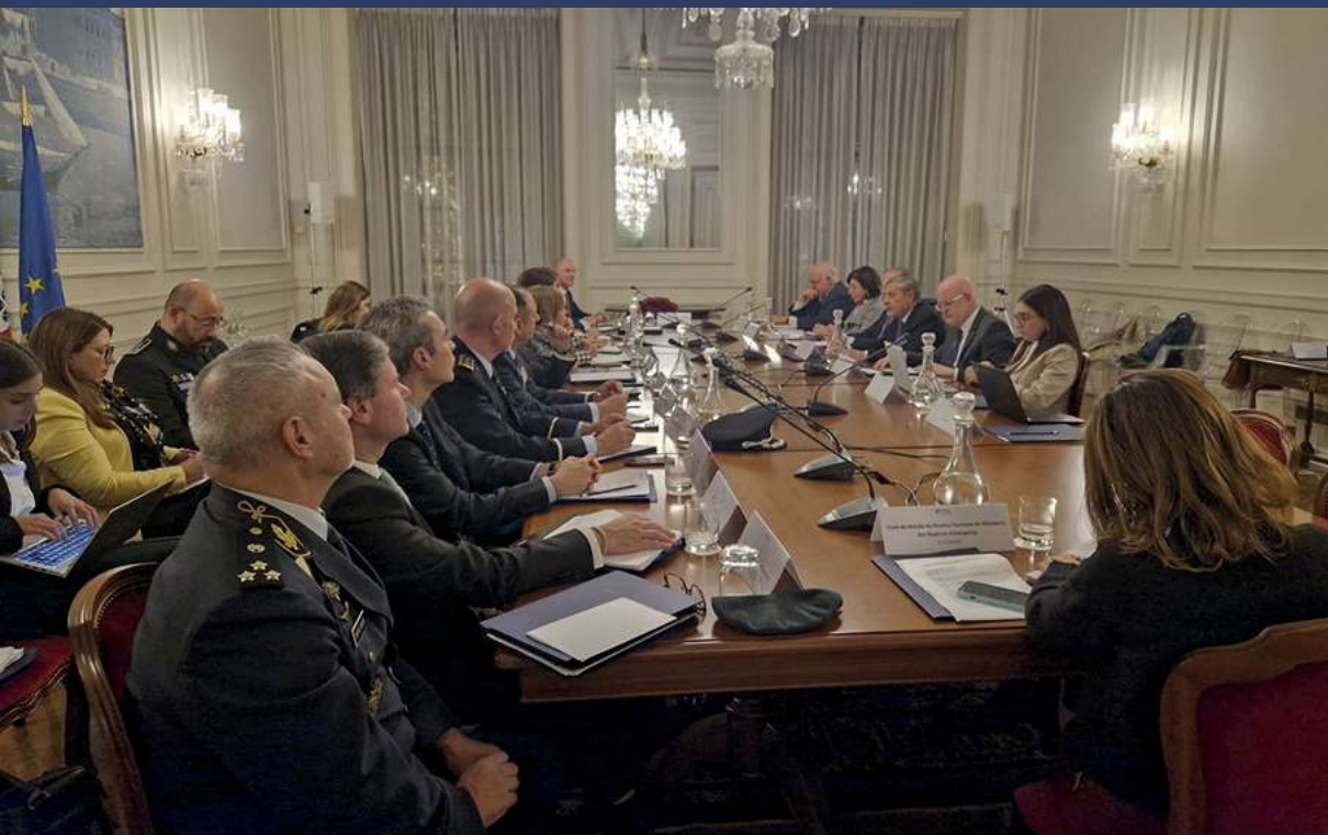
Final talks with the authorities