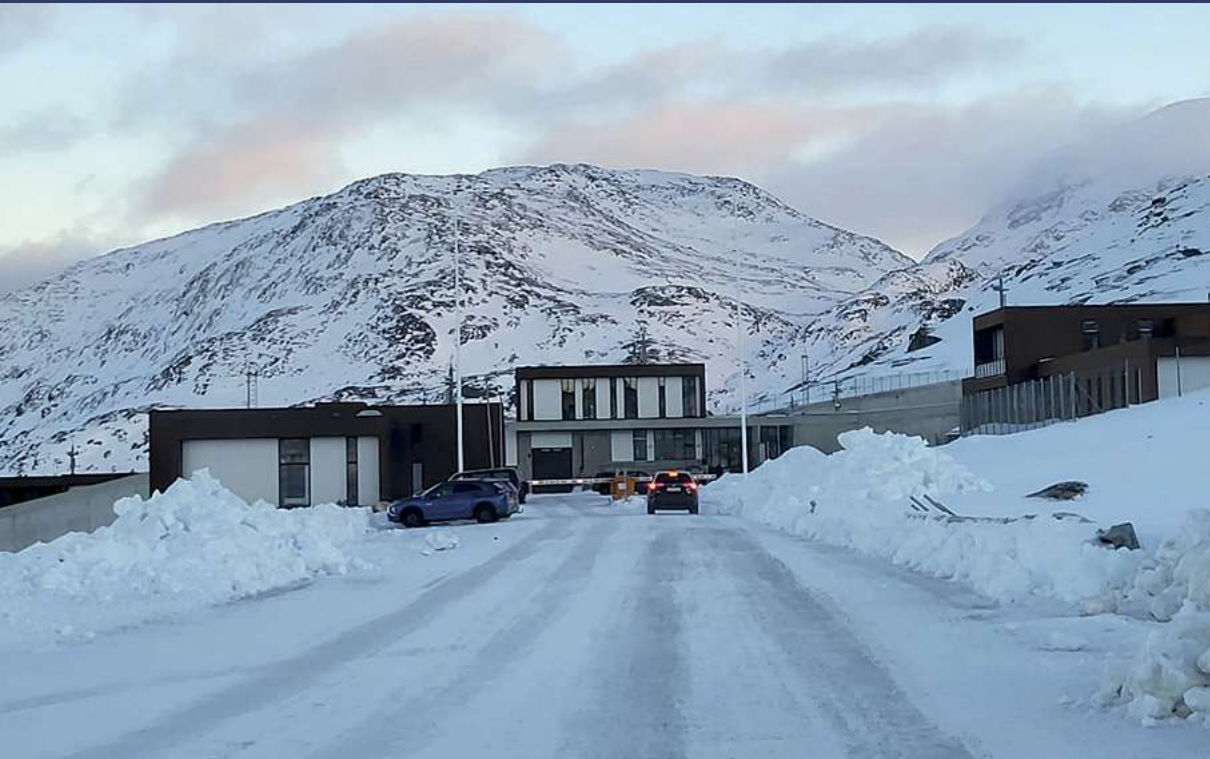
New prison in Nuuk