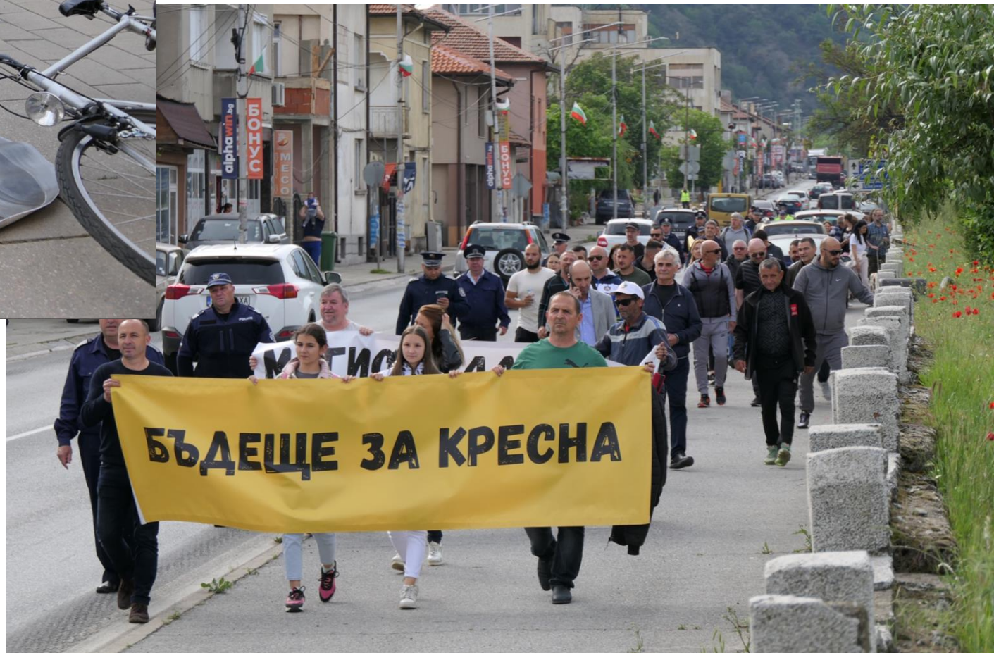
Protest in Kresna, 15 May 2023