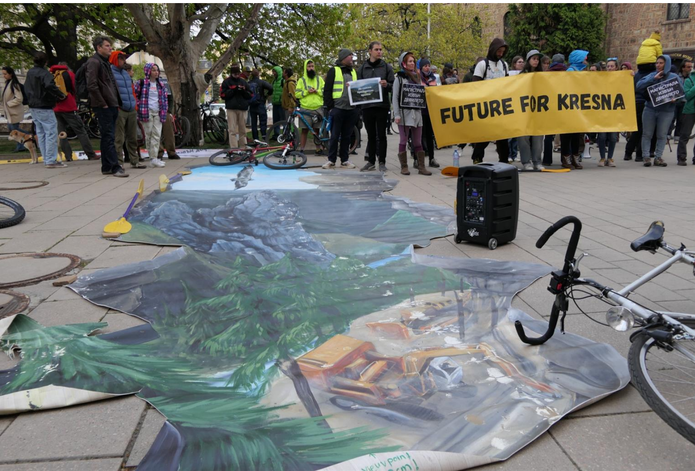
Protest in Sofia, April 2023