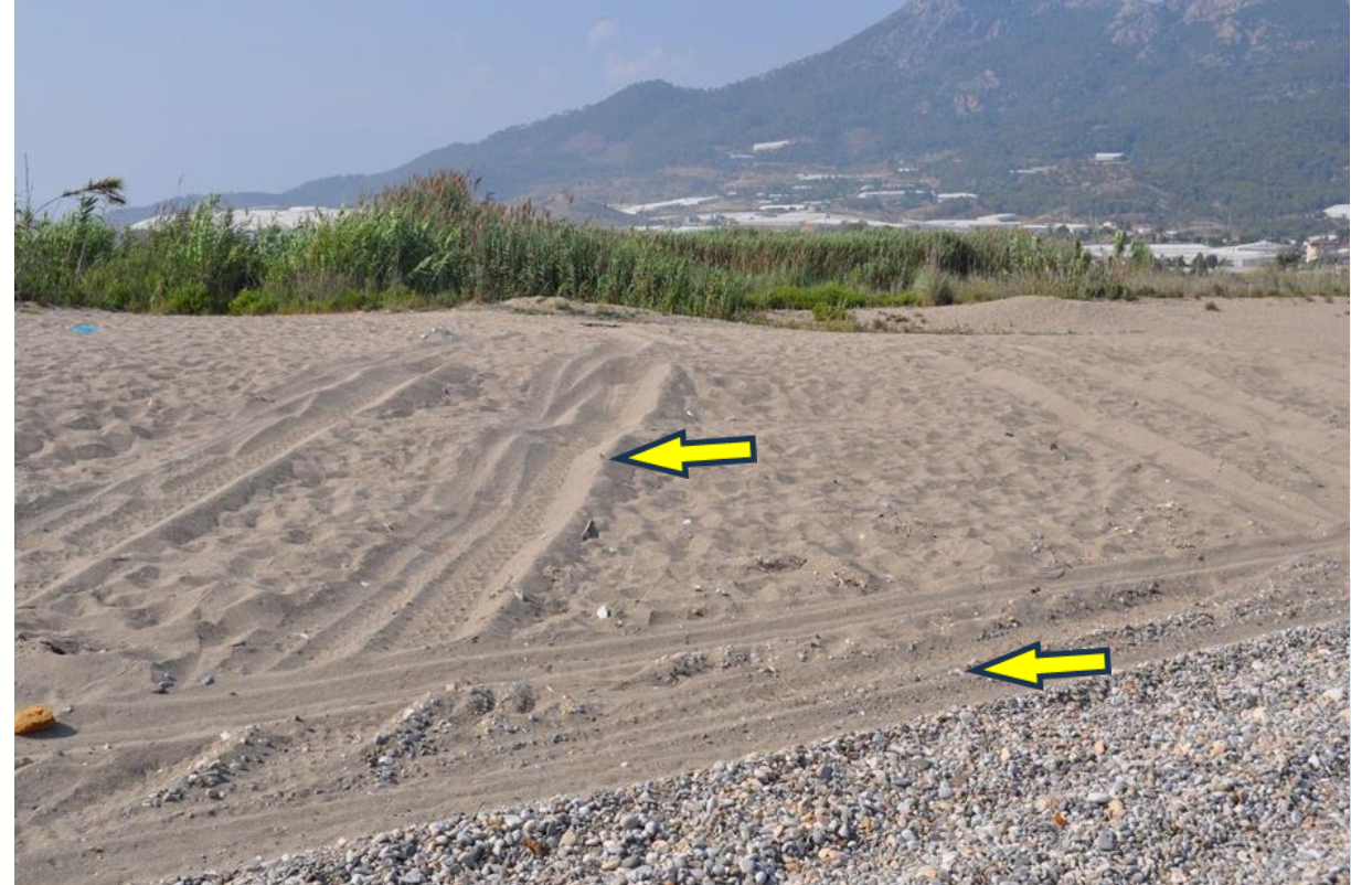
Vehicle tracks on the dunes