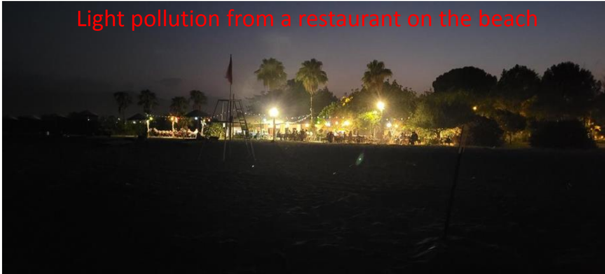
Light pollution from a restaurant on the beach