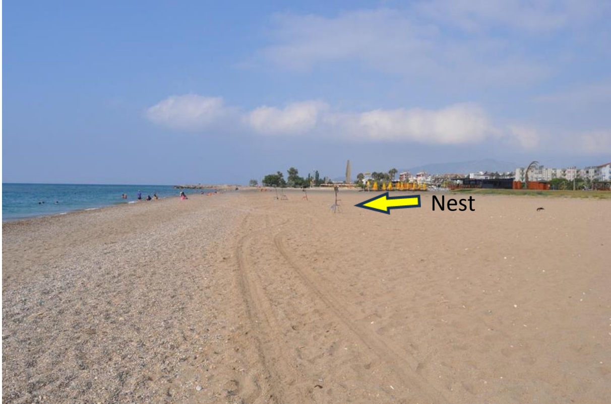
Vehicle tracks on the nesting area next to nests